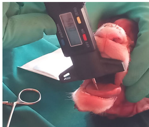
Figure 3. Depth measurement with a digital tyre gauge.

Quantitative variables were assessed by calculating the arithmetic mean and standard deviation values. Group differences were assessed using a two-sample paired t -test, or a Mann–Whitney U rank sum test if the variable was not