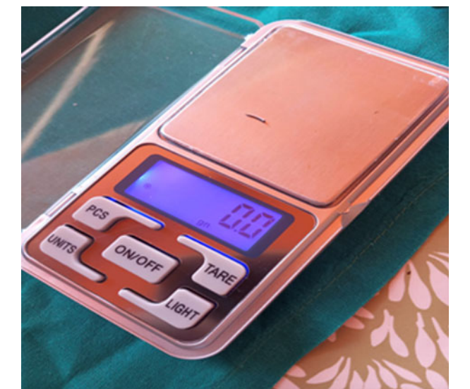
Figure 2. Different sizes of surgical needle fragments are weighed on a digital scale.

Quantitative variables were assessed by calculating the arithmetic mean and standard deviation values. Group differences were assessed using a two-sample paired t -test, or a Mann–Whitney U rank sum test if the variable was not