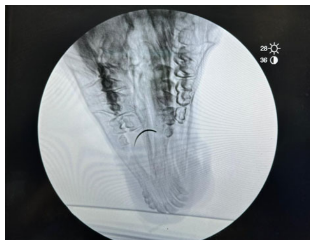
Figure 4. X-ray of a lamb's head with a surgical needle fragment in its tongue.