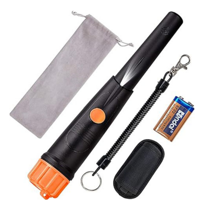
Figure 1. High-sensitivity metal detector (model IP-68; Inkbird Plus, Shenzhen, China).