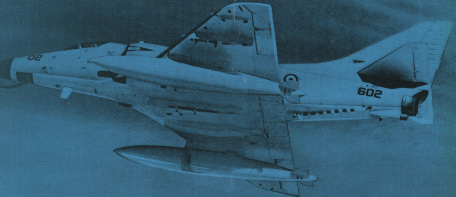
A Decca Doppler equipped A4S Skyhawk

Throughout the world, Aviation relies on Decca for safety and reliability in navigation.