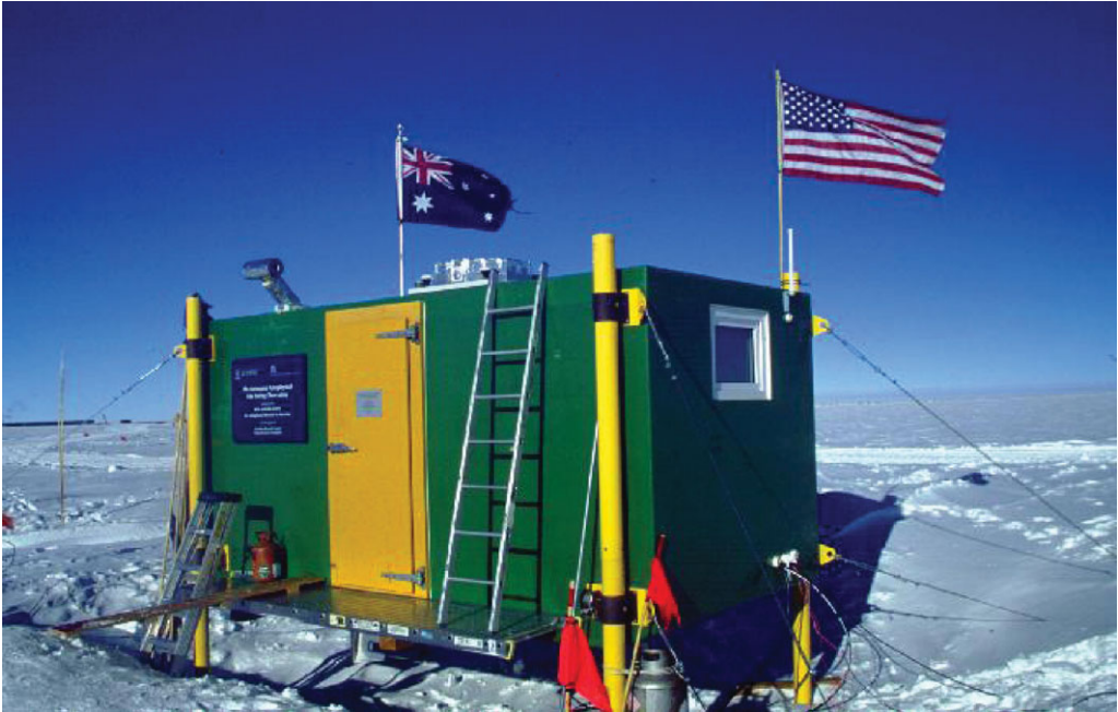
Figure 1. The AASTO at the South Pole from 1997.