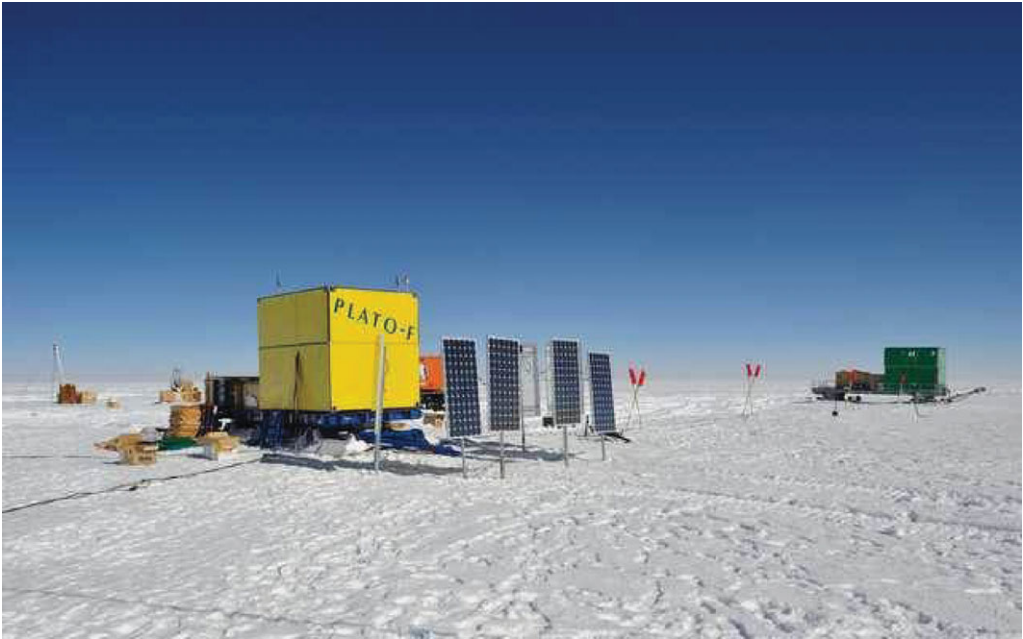
Figure 5. PLATO-F installed at Dome F in 2011.