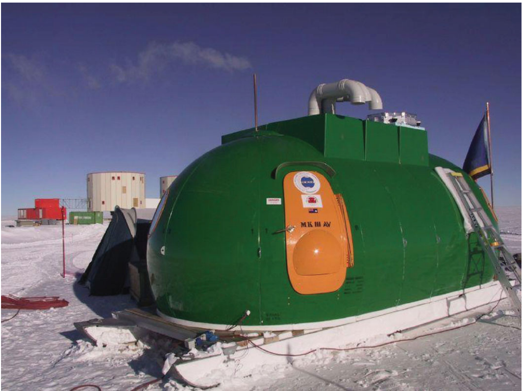
Figure 2. The AASTINO at Dome C in 2003.