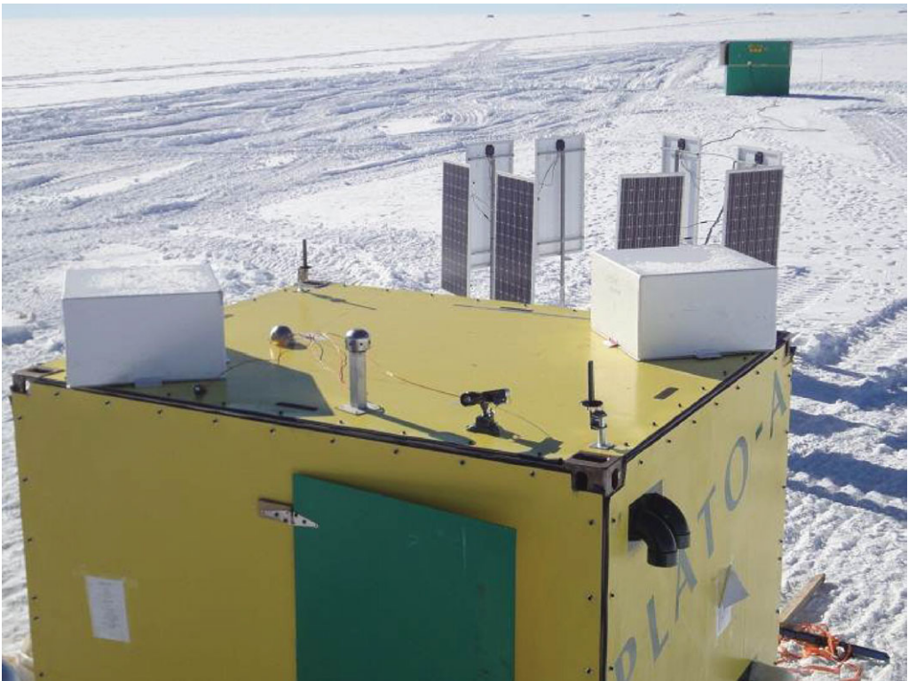
Figure 4. PLATO-A installed at Dome A in 2012.