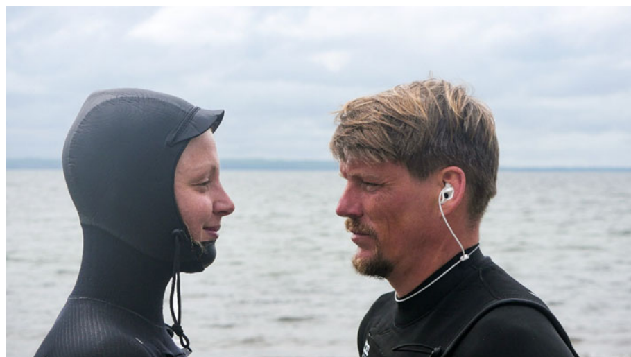
Figure 1. Photograph showing neoprene hood (left) and earplugs (right).

A positive attitude towards the use of earplugs was reported by 70 per cent 31 and 56 per cent 32 of surfers surveyed in the UK. According to Nakanishi et al. , 24 earplugs in surfing are used more often by professionals than by amateurs. In contrast, Simas et al. 18 confirmed the use of hearing protection equipment in 17 out of 93 (18 per cent) amateurs and only 1 out of 20 (5 per cent) professional surfers. 18 The reasons for using external auditory canal protection are usually associated with advanced external auditory exostosis severity and otological complaints. 15,21,26,27