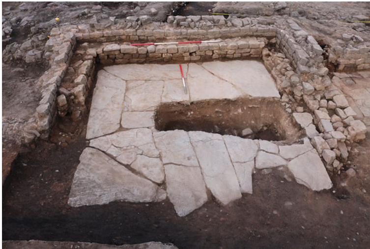
FIG. 4. Birdoswald: Stone floor of secondary building in Area A.

(1) Birdoswald ( Banna ) (NY 615 633): two areas were excavated in the eastern extramural settlement outside the Hadrian's Wall fort, the extent of which is known from previous geophysical survey. 24 Area A measured 25 × 13 m and was positioned to locate and contextualise a building previously exposed briefly by Ian Richmond and interpreted as a signal tower. 25 This building survived to 2 m in height, and steps led down to a semi-basement. To the north were further structures, part of a large complex identified in geophysical survey. A broad primary wall to a building east of the excavated area was abutted by an apsidal wall, the area between the walls being surfaced by regular flagstones. A stone bench-end was found laid on these flags. The wall of the apsidal structure was cut by a free-standing square stone building, floored with large slabs (FIG. 4). This building was associated with a bifurcated water-main; one branch broke through the walls of the apsidal structure, the other ran to the west of and parallel to the square building. The evidence comprised iron pipe-connecting rings (FIG. 5) set upright in narrow trenches. A thick and widespread deposit of soot and charcoal, together with box-flue tile fragments and spacer bobbins, suggest the very close proximity of the fort bath-house.