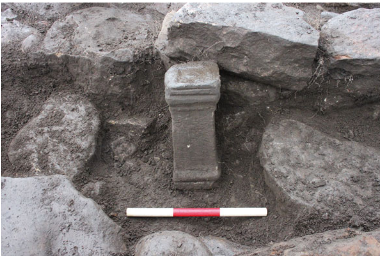
FIG. 6. Birdoswald: Portable altar in situ in Area B. The inscription was not legible.

Area B, which measured 14 \times 11 m, was situated 35 m east of the principal east gate of the fort. Two stone-built strip-buildings facing onto the Military Way were excavated. One respected the width of the double gate portal, the second respected the width of the gate after its reduction to a single carriageway in the third century. They were built and floored in part with massive stone slabs. A rubble ridge, long recognised as an earthwork, and previously thought to represent spoil from the nineteenth-century excavation of the east wall, was proved to represent the northern walls of the strip buildings. Finds included two domestic portable altars (FIG. 6).