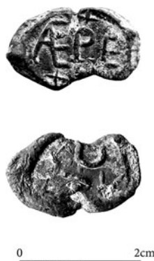
FIG. 9. Carlisle Cricket Club: Lead seal.

Epigraphic evidence from the site also sheds light on the population using the bath-house. For a long time, the main evidence that the Ala Petriana was stationed at Stanwix fort was limited to a reference in the Notitia Dignitatum Occidentis (XL.18) and an inscription found while digging the foundations of Carlisle Journal Office in 1860 (RIB 957), which predated the end of the reign of the emperor Trajan. Further evidence comes in the form of stamped lead seals. The first, found in 1986, confirmed the presence of this unit on the site of Stanwix fort (RIB 2411.84). Further evidence for the presence of the Ala Petriana now comes in the form of a second stamped lead seal found by the Cricket Club excavation's official metal detectorist (FIG. 9). Fragments of four stone inscriptions have also been found at the site and examined by Roger Tomlin. 31