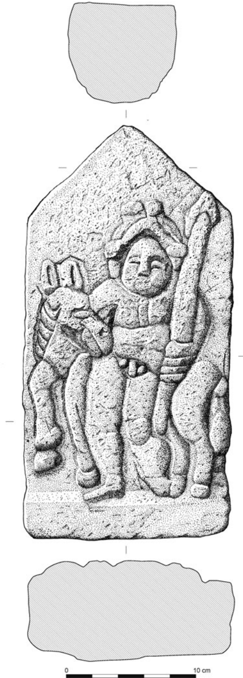
FIG. 11. The Vindolanda carved figure with mule.