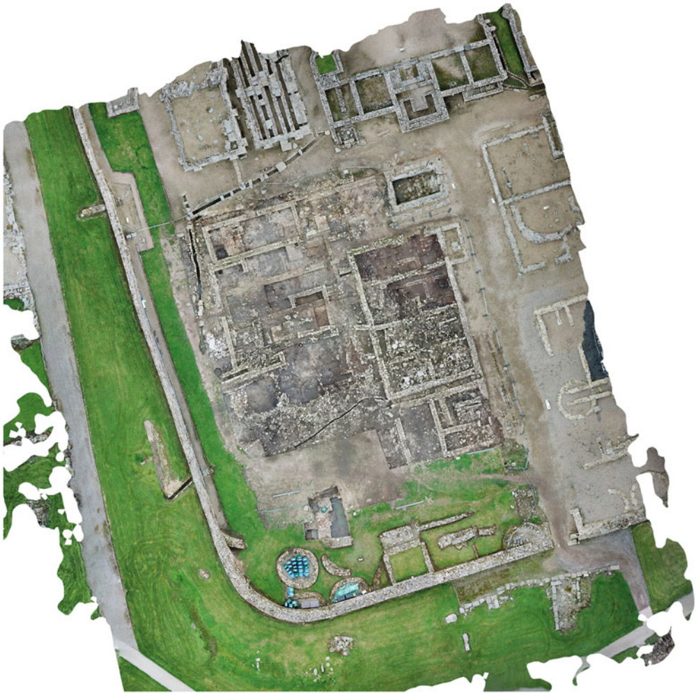
FIG. 10. The south-western quadrant excavations at Vindolanda in August 2021.

that encountered behind the cavalry barracks in the south-eastern quadrant, extended from the barrack buildings lining the side of the via decumana in the east to the intervallum road to the south and west. The cavalry barrack produced a variety of military equipment, which included several fine examples of lance heads and other associated cavalry equipment. The primary floor surfaces within the barracks were a mixture of cobble stones packed with clay and flagstone set in clay foundations. Although several rooms were extensively damaged by later sub-Roman and post-Roman constructions, an examination of the internal dimensions and appointments of the rooms provided clear evidence for the separation of the living accommodation for soldiers and their horses. The domestic spaces, situated on the western side of the barracks, were furnished with clay ovens. Rooms that functioned as stables faced onto the via decumana , and were finished with rougher cobbled floor surfaces, some of which had sunken into central pits.