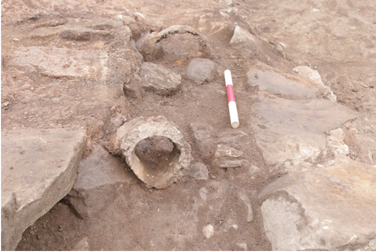
FIG. 5. Birdoswald: Iron water-pipe connectors, Area A.

Area B, which measured 14 \times 11 m, was situated 35 m east of the principal east gate of the fort. Two stone-built strip-buildings facing onto the Military Way were excavated. One respected the width of the double gate portal, the second respected the width of the gate after its reduction to a single carriageway in the third century. They were built and floored in part with massive stone slabs. A rubble ridge, long recognised as an earthwork, and previously thought to represent spoil from the nineteenth-century excavation of the east wall, was proved to represent the northern walls of the strip buildings. Finds included two domestic portable altars (FIG. 6).