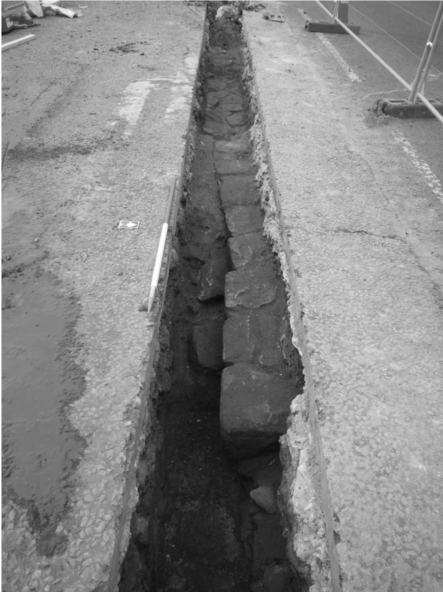
FIG. 12. Sandstone part of the southern face of Hadrian's Wall at West Road, Fenham.

wide, effectively forming one continuous trench. The trench was excavated to a depth of between 1.2 m and 1.6 m. At the junction with Newminster Road, approximately 155 m from the south-eastern end of the trench, a c. 4.5 m length of sandstone wall was revealed which is interpreted as representing part of the southern face of Hadrian's Wall (FIG. 12). The stonework