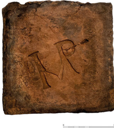
FIG. 8. Carlisle Cricket Club: Stamped hypocaust tile.

tiles were found and the evidence of ceramic, nozzled tubes and ‘armchair voussoirs’ suggests the presence of a vaulted roof. A key difference between the stacks of square hypocaust tiles recovered from the Hadrianic and Severan bath-houses is that the Severan hypocaust tiles frequently bore stamps. Twenty-nine tiles with an identical ligatured ‘IMP’ stamp, standing for imperator (emperor) have been recovered (FIG. 8). The same stamp has been found of roof tiles from other excavation sites in Carlisle, at Blackfriar’s Street and at Annetwell Street. On the latter site there were indications that the tiles were produced at the beginning of the third century, specifically for the construction of the stone fort and its ancillary buildings 30 . The evidence from the Cricket Club site now demonstrates a larger programme of building.