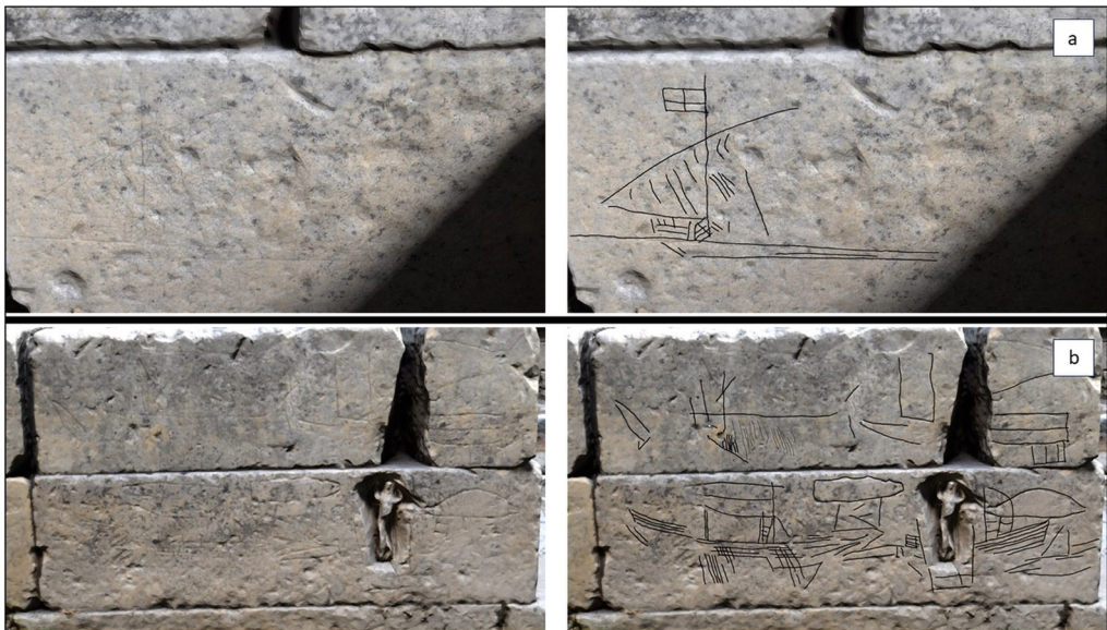
Figure 3. Screen captures of the south-facing wall of the cell from the digital surrogate: left) with no digital elaboration; and right) with elaboration of the nautical graffiti (figure by authors).

have so far been identified (Figures 3 & 4). Consistent placement of the target-like graffiti on horizontal surfaces suggests that they were gameboards for the game known as Nine Men's Morris, while the nautical graffiti can be linked to vessels used by the Knights of Malta in the sixteenth century (Figure 5).