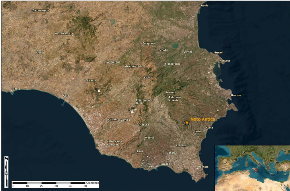
Figure 1. Map of south-eastern Sicily showing Noto Antica's location (figure by Scott Kirk; base map: Earthstar Geographics).

the trails of this medieval city turned archaeological park. Gambin and Kassulke (2023) note that some masonry from the prison has been reused elsewhere in the city, as evidenced by ship graffiti found at the church of the Madonna dei Miracoli. The digital photogrammetric modelling of the castle prison itself has revealed the graffiti still visible on the stone there.