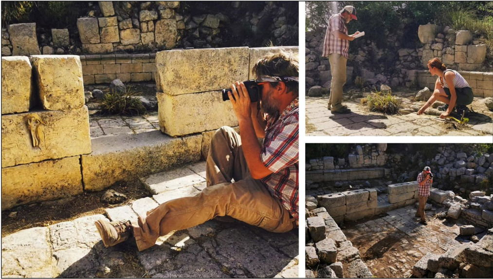
Figure 2. Capturing photogrammetric image sets of the two rooms of the castle prison in Noto Antica.

have so far been identified (Figures 3 & 4). Consistent placement of the target-like graffiti on horizontal surfaces suggests that they were gameboards for the game known as Nine Men's Morris, while the nautical graffiti can be linked to vessels used by the Knights of Malta in the sixteenth century (Figure 5).