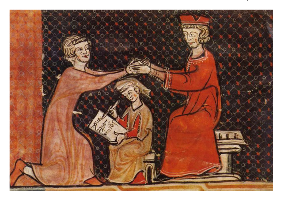
Figure 2. Thirteenth-century rendering of a feudal homage ceremony. "Hommage au Moyen Age" (1293).

American culture.<sup>24</sup> Early in the novel, George Balcombe celebrates the natural "aristocracy" of white American men emerging from "the ancient cavaliers of Virginia" as possessing the highest racial "honour." Like other defenders of a racial social hierarchy supposedly instituted by nature, Balcombe sees no place for black people in such an "aristocracy" because of their "inferiority," which emerges, in a theological or metaphysical sense, from their "instinct of blood." This justification for subordination barred them from associating with white people except through a relationship reminiscent of homage defined by the "interchange of service and protection" or a "filial and parental bond." Later, Balcombe recounts the "prostration" of a "poor negro's spirit" to the white male narrator. Balcombe asks the narrator, "is there nothing analogous to this" and "the humility of the angels who cast their crowns at the feet of God?" He continues, "If the duties of heaven require these sentiments, and its happiness consist in their exercise, which of us is it that is but a little lower than the angels—the negro or the white man?" "Let women and the negroes alone," Balcombe concludes, "leave them in their humility, their grateful affection, their self-renouncing loyalty, their subordination of the heart, and let it be your study to become worthy to be the object of