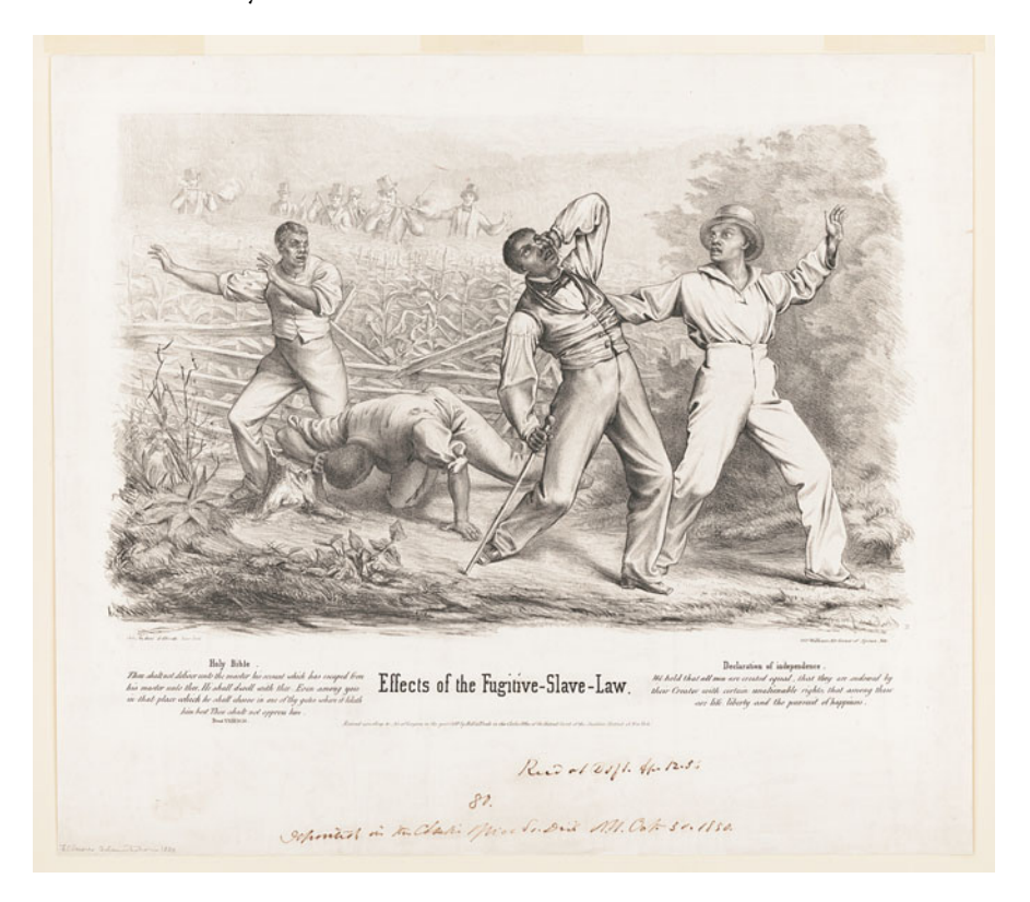
Figure 4. "Effects of the Fugitive-Slave-Law," a political cartoon published by Hoff & Bloede in 1850.

perpetuated the system in the South.<sup>83</sup> In 1843, James McCune Smith described the operation of racial feudalism in Ohio (and, by extension, other parts of the North) as a condition under which "our people (the people of color)" were "shut out from the pale of citizenship, excluded from giving testimony before the courts of Justice (?) and barely suffered, under a heavy bond, to maintain a foothold on the soil, in short, dehumanized as far as laws could reach." Summarizing this view, he described the unique manifestations of racial hierarchy that black people encountered as "northern hate" and "southern fear." The imposition of a racial order through the enslavement of black people in the South and their concomitant subordination in the North prompted Douglass to exclaim in 1847, "In reality, there is not a free colored man in the United States. Theoretically, we are free—practically, we are slaves."