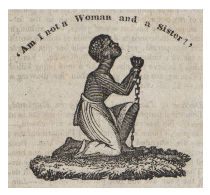
Figure 3. Enslaved woman genuflecting (or supplicating). This figure, which was taken from The Liberator's printing of a lecture that Maria Stewart delivered in 1832, is one of many widely circulated images that generally depicted a black man in the same position. The year 1787 marked the initial distribution of such portrayals by way of the London-based Society for Effecting the Abolition of Slave Trade, which was led by Quakers. On the origin and ubiquity of the kneeling slave image as well as black abolitionist responses and reinterpretations of its meaning—including Frederick Douglass's—see John Stauffer, "Creating an Image in Black: The Power of Abolition Pictures," in William Fitzhugh Brundage, ed., Beyond Blackface: African American and the Creation of American Popular Culture, 1890–1930 (Chapel Hill, 2011), 70–74. For the image see Maria Stewart, "Lecture Delivered at the Franklin Hall, Boston, September 21st, 1832," The Liberator 2/46 (1832), 183.

in the name of liberty and equality resulted in a bloody civil war that did not establish their rights. Rhetorically connecting the concept of fealty still extant in modern Europe to American slavery, Douglass writes,