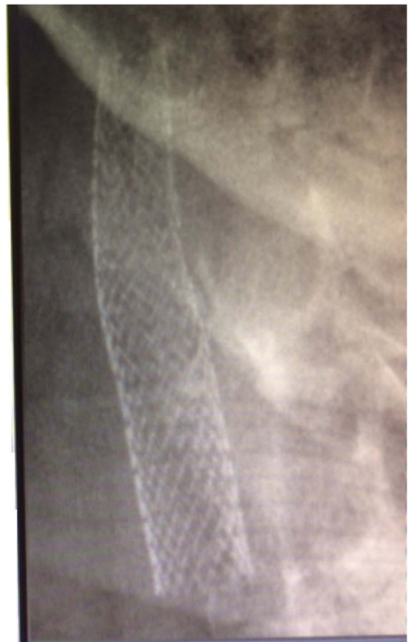
Figure 2: AP neck X-ray 6 weeks post-stenting.

From the Departments of Medical Imaging, and Clinical Neurological Sciences, Schulich School of Medicine and Dentistry, Western University, London, Ontario, Canada.