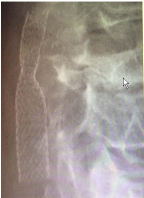
Figure 1: AP neck X-ray immediately post-stenting.

In the major randomized controlled trials (RCTs) comparing carotid endarterectomy to carotid angioplasty and stenting (CAS), the endovascular procedure is performed using pre-and