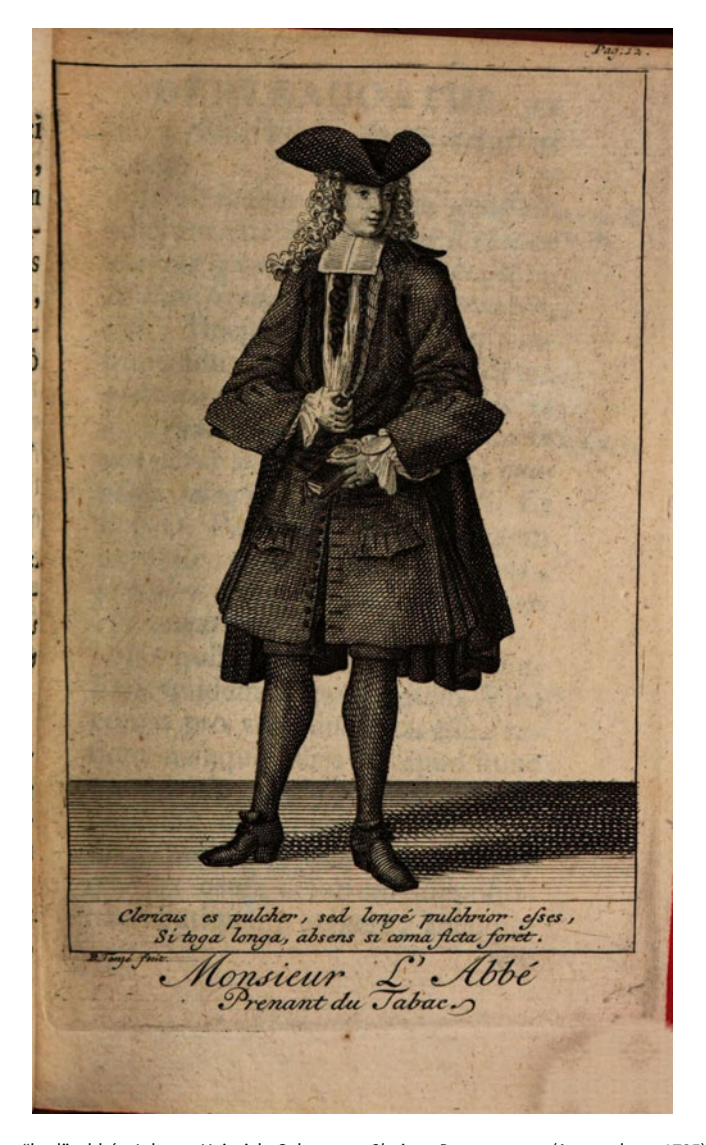
Figure 3. The "bad" abbé, Johann Heinrich Cohausen, Clericus Deperrucatus (Amsterdam, 1725), Bayerische Staatsbibliothek München, J.can.p. 873, (0037).

by failing to shave properly they revealed an inappropriate even unholy attachment to the secular world. ^{57}