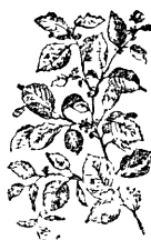
The Witch Hazel Plant.

This drug is highly commended by the British Medical Association's Committee on Therapeutics. Hazeline, being prepared from the fresh green twigs, contains all the valuable volatile principles of the plant Witch Hazel, and is much more uniform and reliable in its action than are the tinctures, fluid extracts, etc., prepared from the dried bark.