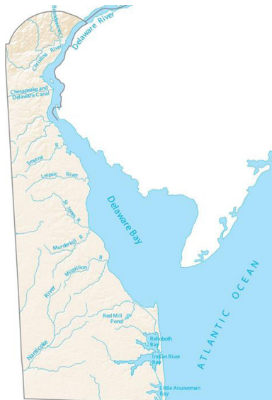
Figure 2. Major rivers in Delaware.

including ponds, rivers, and streams. The better-known ponds include Becks, Lums, and Trap Ponds. Sheerness Pond in the center of the state is the largest at 250 acres. Figure 2 is a map of the major rivers.