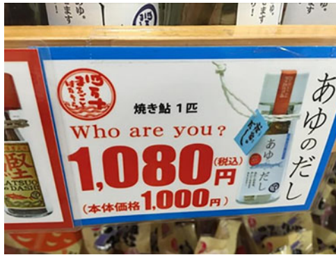
Figure 1. Who are you?

linguistic knowledge. Figure 2 displays a sign placed at a dentist's office with the text '歯 appy 歯 alloween', which is a hybrid phrase of Japanese script and the Roman alphabet. The kanji character 歯 in the text represents a tooth and is pronounced as 'ha' in Japanese. Thus, the text reads as 'ha-appy ha-alloween' to individuals who understand both kanji and English. The individuals who can fully comprehend this wordplay are those who possess graphic and phonetic knowledge of kanji , which enables them to recognise the character 歯 and its pronunciation. Moreover, comprehending this wordplay requires bridging the linguistic and cultural aspects of both Japanese and English. Contextual information, such as the location and timing of the text