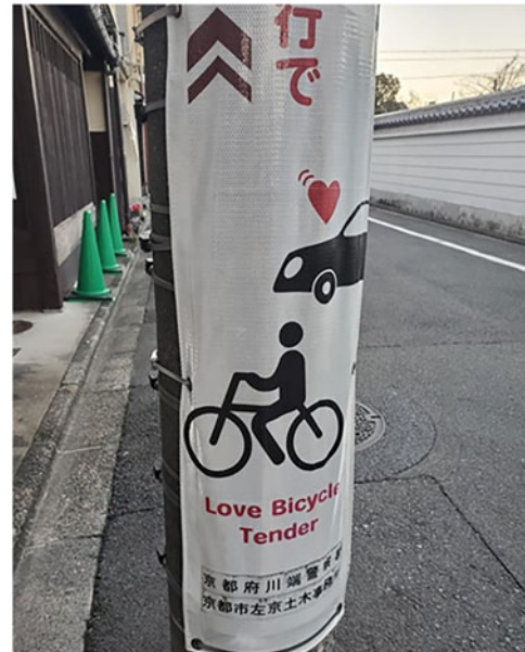
Figure 5. Love Bicycle Tender

by substituting the final '-ri' of the Japanese word 'benri' with '-ly', using English orthography for romanisation and mimicking the structure of an English adverb.