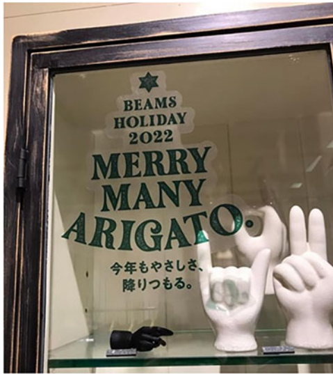
Figure 3. MERRY MANY ARIGATO

similar, adding an interesting phonetic effect when read together.