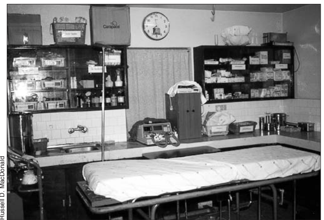
Fig. 3. Emergency department treatment room