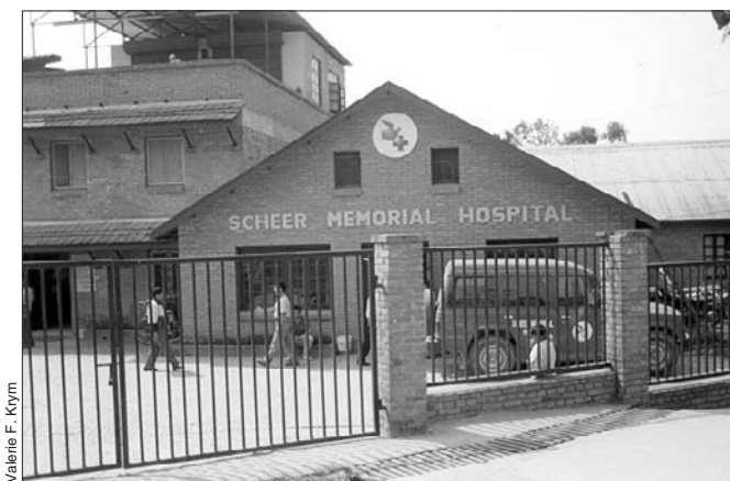
Fig. 2. Front gate and main entrance to Scheer Memorial Hospital