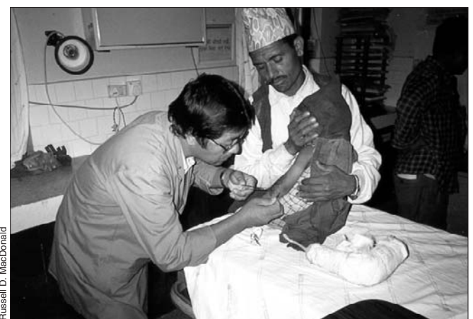
Fig. 4. Lay health care worker removing cast and sutures from pediatric patient