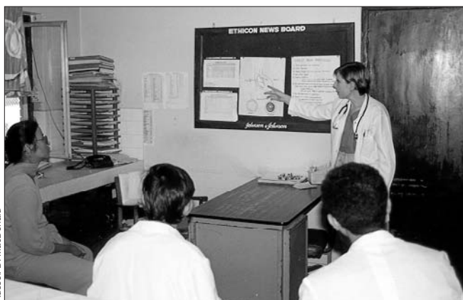
Fig. 5. Principal author (VFK) delivering daily teaching session.

We also identified the need for formal health care training for the ED manager and approached the hospital administration with a proposal. We identified an overseas donor to sponsor the ED manager in a nationally recognized community health care worker program that in-