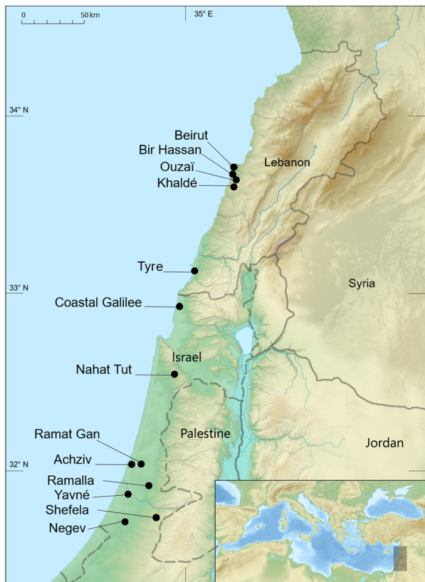
FIG. 1 Present and historical distribution of Astragalus berytheus on the eastern Mediterranean coast (see Supplementary Table 1 for additional details). The only extant population in Lebanon is in Tyre Coast Nature Reserve (see text for details).

(Family Asteraceae), which originated from the USA; it is an invader of coastal sand dunes (Sternberg, 2016) and was introduced into the Middle East in 1975 (di Castri et al., 1990). It was first observed in the Reserve in 1999 (Tohmé & Tohmé, 2009), and in 2015 it invaded A. berytheus habitat. Eradication has, however, allowed A. berytheus to recover