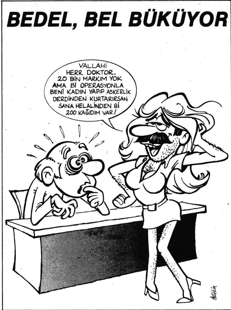
FIGURE 3.5 FEBAG activists published a humorous cartoon in their newsletter, conveying the desperation that young migrants felt when trying to pay their way out of military service, 1984. The caption reads: “By God, Herr Doctor, I don’t have 20,000 marks, but I do have 200 bucks for you if you’ll do an operation to make me a woman and save me from military service.”