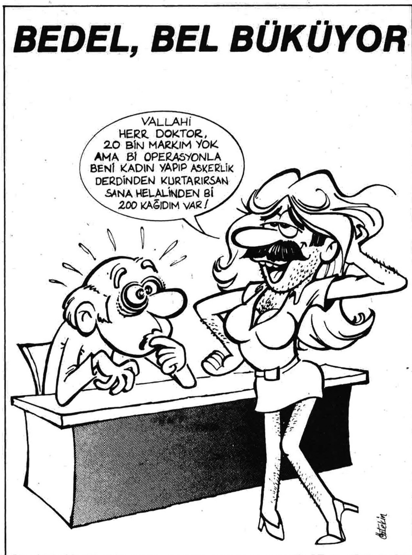
FIGURE 3.5 FEBAG activists published a humorous cartoon in their newsletter, conveying the desperation that young migrants felt when trying to pay their way out of military service, 1984. The caption reads: "By God, Herr Doctor, I don't have 20,000 marks, but I do have 200 bucks for you if you'll do an operation to make me a woman and save me from military service."