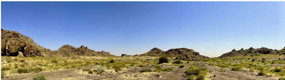
Figure 3. The archaeological site of Jebel Moya, right above the village.