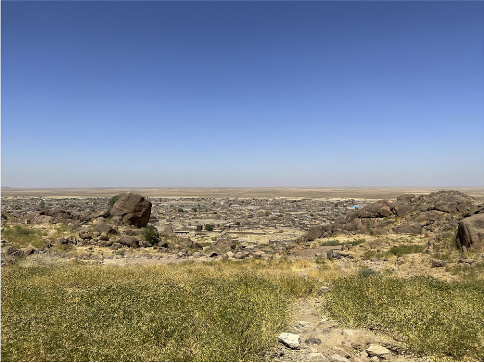
Figure 2. The village of Jebel Moya as seen from the top of the mountain.