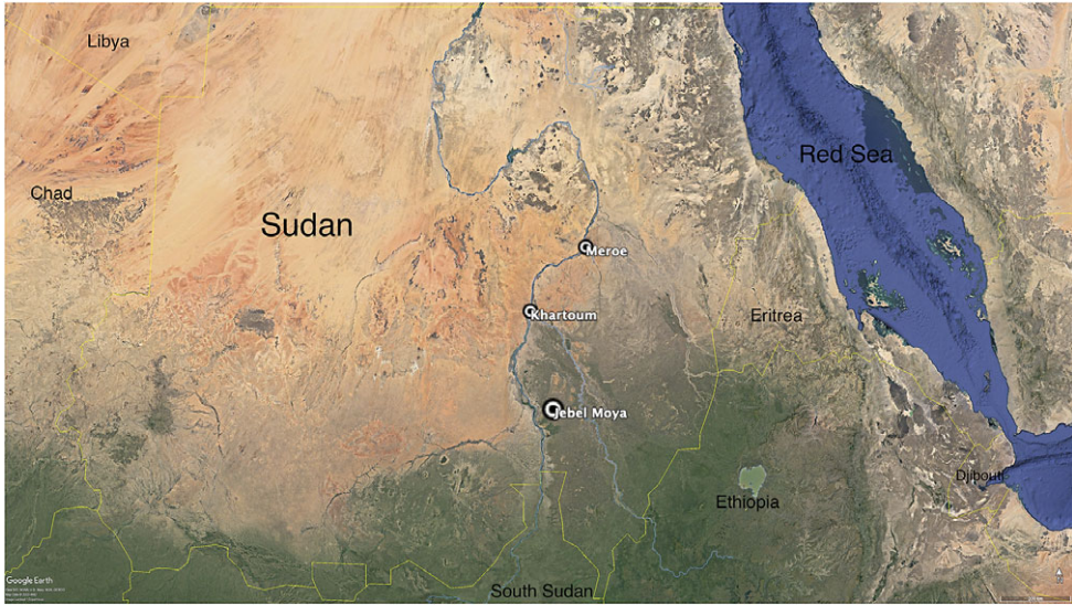
Figure 1. The location of Jebel Moya.

showed the world exactly what that means. Except that the world did not listen. Sure, there was press attention directed towards the 2019 coup, but the many stories and sacrifices of people on the streets barely made a splash in the Global North. 3 The world was warned many times. 4 But nobody listened.