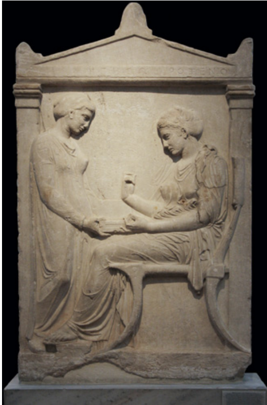
Figure 2 Grave stele of Hegeso (c. 410–400 BCE), National Archaeological Museum (NAMA 3624), Athens.

funerary stelai of a specific family, which were displayed together in a peribolos tomb (a grave enclosure). Since they do not mention his name, Proxenos is accordingly to be identified as Hegeso's father; Hegeso was