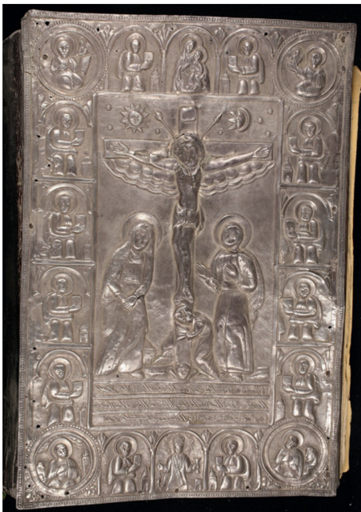
Figure 4 Mardin, Dayr Za‘farān, MS 397 (HMML Pr. No. ZFRN 00397), decorative front cover.