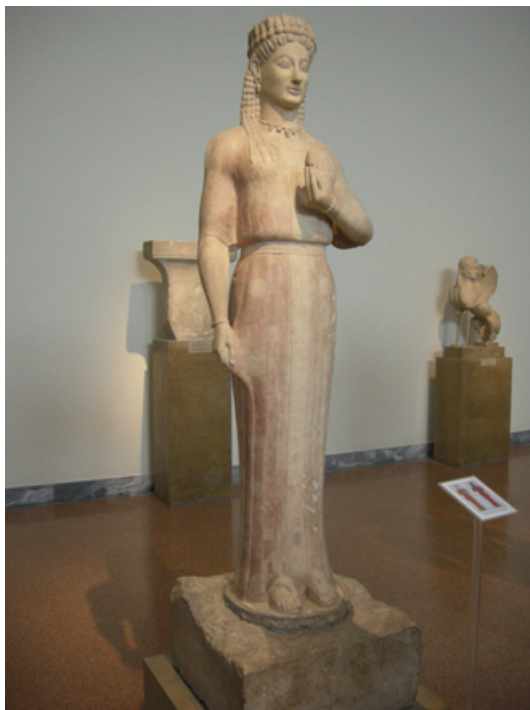
Figure 3 Funerary monument for Phrasikleia (c. 550–450 BCE), National Archaeological Museum (NAMA 4889), Athens.

not certain that the kore represents a maiden (i.e. an unmarried female figure), whether generic or mythological (Persephone being the archetypal mythical kore ). The sculpture represents the visual foil to the aural message of the inscription: the textual-material ensemble ensured that Phrasikleia was both known and seen as a maiden. Did Phrasikleia herself compose the text, cognizant of her impending demise? In the absence of firm evidence, this seems improbable. Phrasikleia's is not the only example of a grave