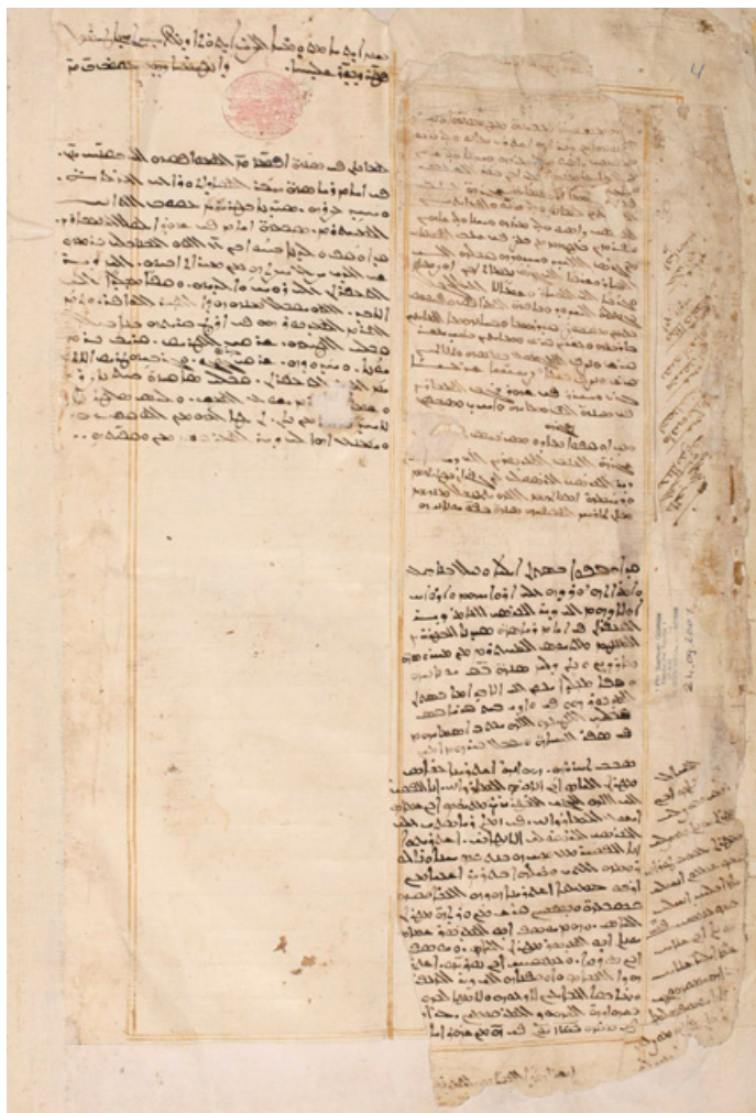
Figure 5 Mardin, Dayr Za'farān, MS 397 (HML Pr. No. ZFRN 00397), p. 687, various endowment notices with subscription and seal of Patriarch Jacob II. Image courtesy of the Dayr Za'farān (Monastery) Mardin, Turkey, and the Hill Museum & Manuscript Library. Published with permission of the owners. All rights reserved.