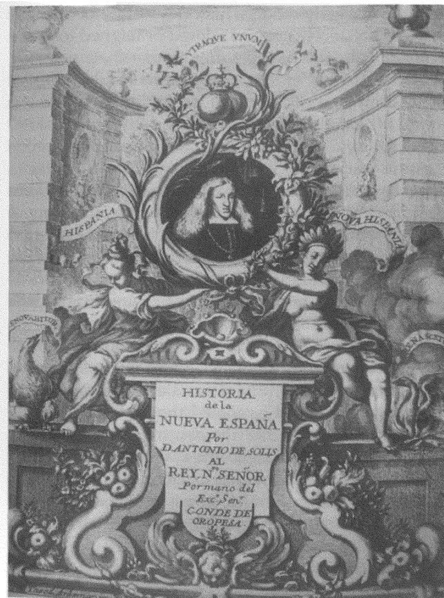
Figure 1 Frontispiece, Antonio de Solís, Historia de la conquista de México, población, y progresos de la América septentrional conocida por el nombre de Nueva España (Madrid, 1684).

obligatory genuflections to rulers, patrons, and censors, however, and they are as characteristic of unofficial or noncommissioned—published and unpublished—histories as they are of official ones. Indeed, it is probable that most such books of kings were not read or commissioned by kings, princes, or their courts but instead sponsored by councils, academies, or circles of the lettered. 1 What can we learn from the royal earwax? Did it perhaps rub off on histories themselves?