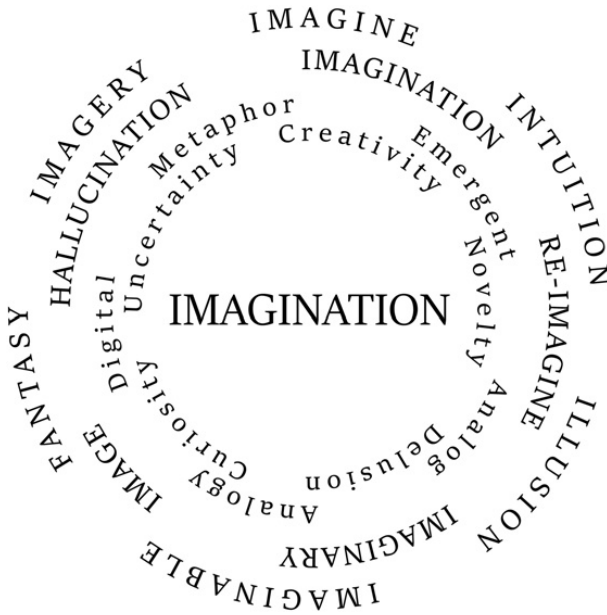
Figure 1 Phases of the imagination.

(which depends on a particular language) with an actual observable object in the world endowed with its own ontological presence and opacity.” 1 Kurt Danziger (1997), a historian of psychology, has similarly criticized contemporary psychology for treating concepts as if they exist independently from how we think about them. We must always remember that “the categories one meets in psychological texts are discursive categories, not the things themselves” (Danziger, 1997, p. 186). As psychology moved from a rich description of phenomena in the lived world to precise measurement, statistical models replaced meaningful dialogue. This is what is meant by the richness versus precision trade-off. Consequently, “theory” in psychology may refer more to artifacts of laboratory operations than to observable phenomena in the lived world. As we review ideas about imagination, it is important to reflectively balance descriptions of phenomena in the world with concepts tied to experimental operations.