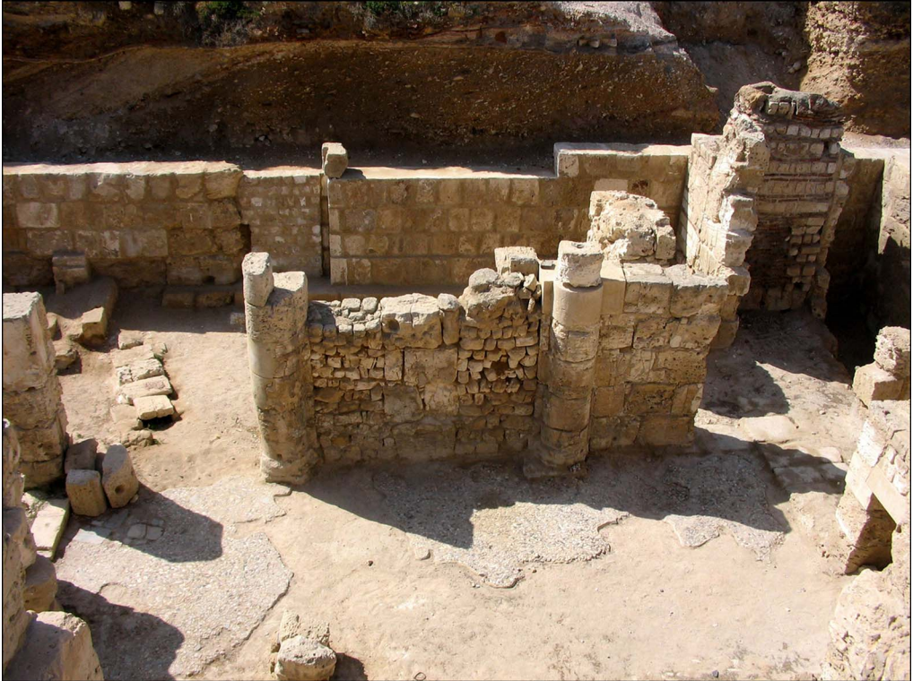
Figure 5. A pseudo-peristyle courtyard.

houses at Kom el-Dikka appears to be almost exclusively typical of Alexandria. There is an entire range of distinctive cornices with square modillions and capitals, representing the so-called Alexandrian style. Samples of painted wall plaster collected from some of the houses resemble the First Pompeian ('structural') style, with the high monochrome socles and stuccowork, imitating opus isodomum (uniformly sized stonework). Similar decoration is known from the second-century BC tombs in the Anfushy and Mustapha Pasha necropolises (Adriani 1952: 47–128). The examples from Kom el-Dikka of apparently later date (mostly first century AD) demonstrate the continuity of the Hellenistic painting tradition in Alexandria over several centuries.