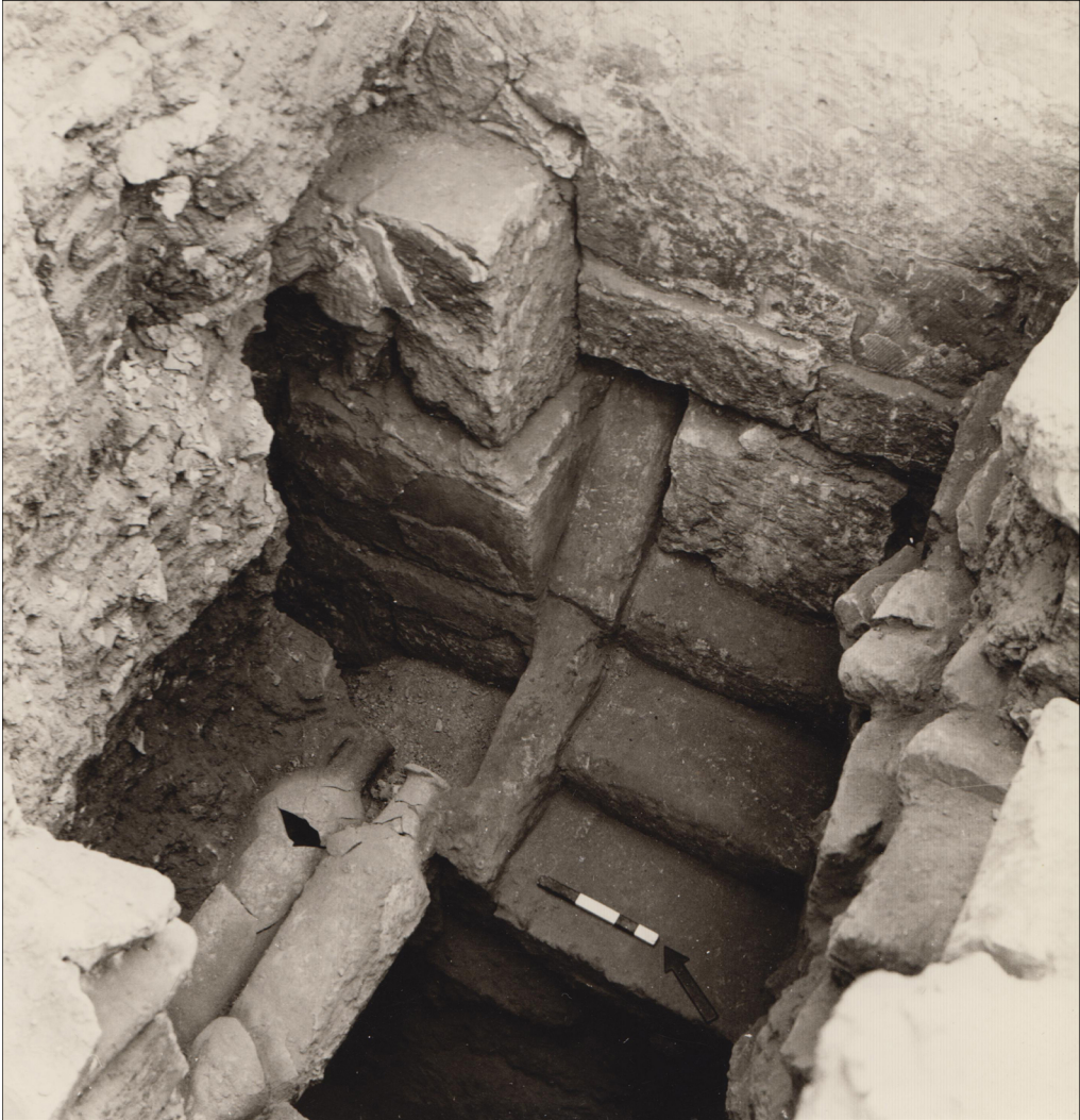
Figure 3. Stepped entrance to one of the houses.

topped with Doric capitals (Figure 5). Triclinia —dining rooms—were revealed in all of the houses. These were usually entered through tripartite doorways, accentuated by columns, leading directly from the central courtyard. Their floors were decorated with mosaics, ranging from simple bichrome geometric designs to the more complex patterns that combine geometric elements with figural motifs, complete with colourful emblemata (central panels that were often highly decorative and finely worked) (Figure 6) (Majcherek 2002). Notably, all of these floor mosaics post-date the period of construction of the houses, which was established from stratigraphic archaeological evidence, and may possibly be associated with Alexandria’s alleged revival in the second century AD.