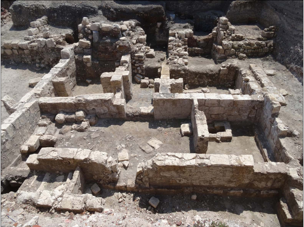
Figure 1. Extant walls of an early Roman house excavated in the 2019 season.

communication necessitates the existence of secondary streets that separate individual city blocks (Adriani 1966). Our excavations at Kom el-Dikka have traced several sections of such streets (Figure 2).