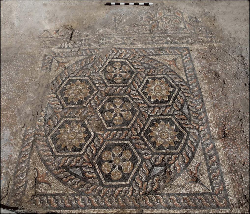
Figure 6. A multicoloured mosaic decorating one of the triclinia.

probably never know. It is hardly surprising that Roman Alexandria's houses draw on a common Graeco-Roman building tradition, but their undeniable allegiance to the Mediterranean world belies the inclusion of indigenous Egyptian elements.