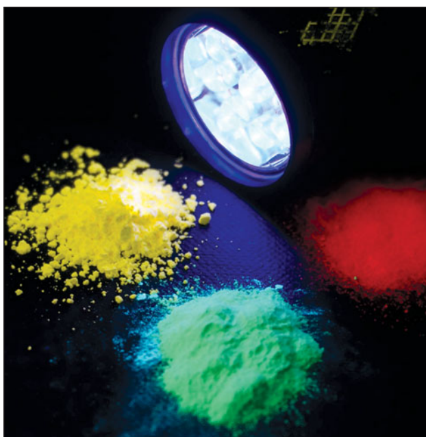
Red, yellow, and green luminescent phosphors and a blue (In,Ga)N LED emitting at 450 nm.

Furthermore, the rare-earth fever around the globe is not directly related to the use of rare earths in luminescent materials. The market value for phosphors in 2015 was one-third of the rare-earth market, but in terms of volume, they are a rather modest application (about 7%), according to the study “Rare Earths and the Balance Problem,” published by Binnemans and Jones. When scientists were asked if they believe that the risk for shortage