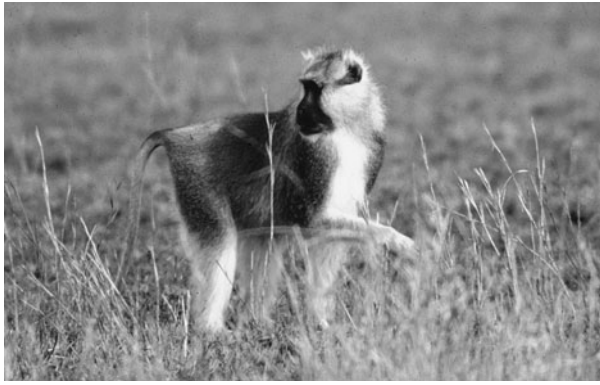
PLATE 1 Adult male southern patas monkey E. p. baumstarki in the Northern Extension of the Serengeti National Park, Tanzania.

(567 km 2 ). This area was chosen for survey based on reports by R. Radke (pers. comm.) in 1998 of patas in the western Serengeti. The vegetation in the western Serengeti includes open grassland plains, medium-dense Acacia/Balanites woodland-bushland, and riverine forest along the Grumeti River. Three rivers (Grumeti, Momukomule and Rubana) provide water to the area (Fig. 1). Even during the driest periods these rivers usually provide widely scattered pools of water. The Rubana River, along the western boundary of the Nyakitono Open Area (Fig. 2), is considered the most important wildlife water source in the area. One water trough in this area serves as a permanent water source for wildlife.