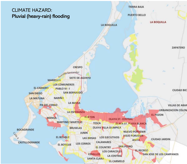
Figure 3. Risk map of pluvial flooding (due to heavy rain) with most severe impacts in the poor neighborhoods near the swamp of La Virgen. (Created with https://midas.cartagena.gov.co/ )

that regulate land use, and the inherited French civil code that regulates land acquisition (Table A.1 in Supplementary Materials). Like many cities, Cartagena was built applying colonial building codes and planning ideals from other bioclimatic zones, and deforesting and developing the coastal zone. It is not well adapted even to the present climate, and risk maps classify large parts of the city as high-risk. 5 While the Plan 4C produced maps for a wider range of hazards and scenarios, those displayed here (Figures 2 and 3) illustrate a heightened risk of pluvial (i.e., rain-induced) flooding for the poor neighborhoods near the swamp of La Virgen, while risk from coastal flooding affects most of the city's coastline. We found considerable pluralism in the selective application of the Plan 4C and in how formal laws compete with norms that determine everyday access to land and housing; from the "the law of the four poles," mobilized by the poor, to old titles from the colonial times, mobilized by the elite (see third subsection). According to a legal advisor to Cartagena's municipal council: