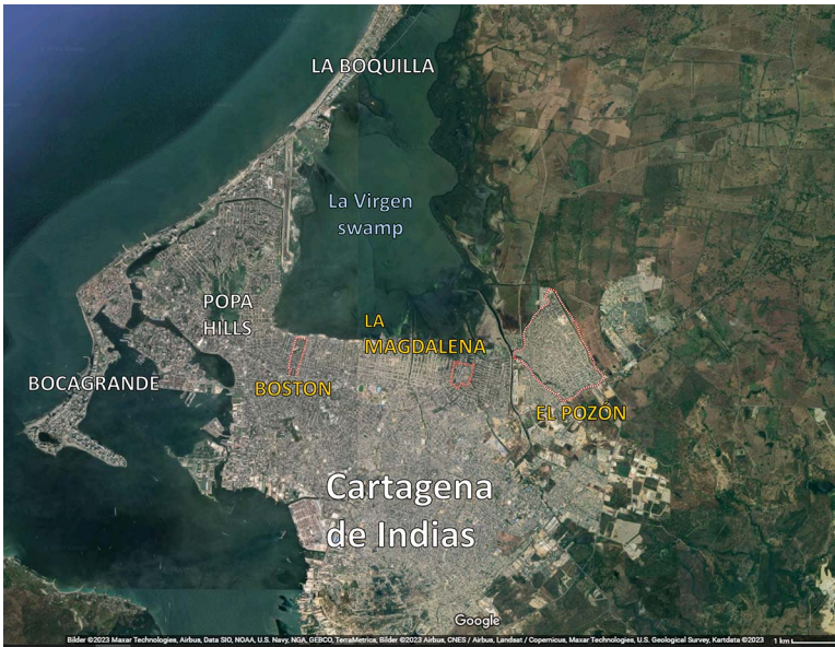
Figure 1. Map of the study areas (in orange) and the La Virgen swamp (blue). Other points of reference in white (Creation: Google Maps).