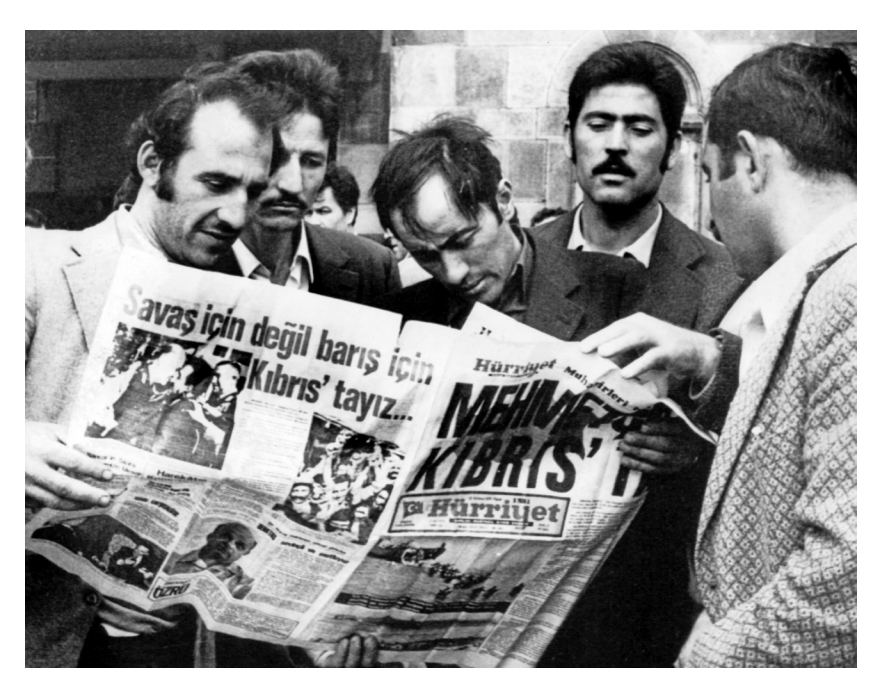
FIGURE 1.2 Guest workers read the Turkish newspaper Hürriyet at a train station in Hanover, 1974.

a time before the proliferation of Turkish coffee houses opened by guest workers seeking self-sufficiency, train stations were a last resort. Back then, Mahir explained, "We had no other places."<sup>22</sup>