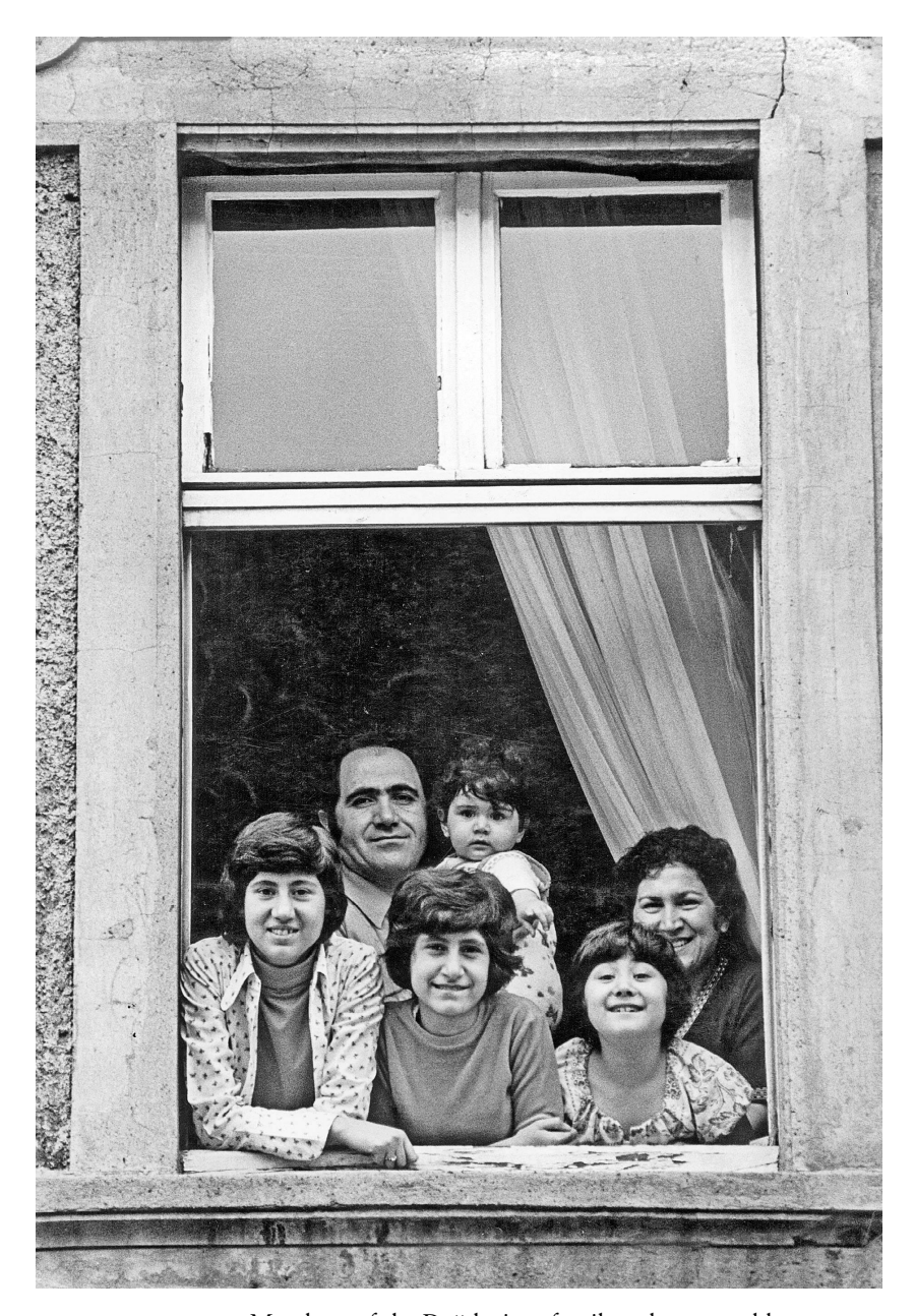
FIGURE 1.4 Members of the Dağdeviren family, who were able to migrate through West Germany's family reunification policy, smile from their apartment window in Munich, 1969.