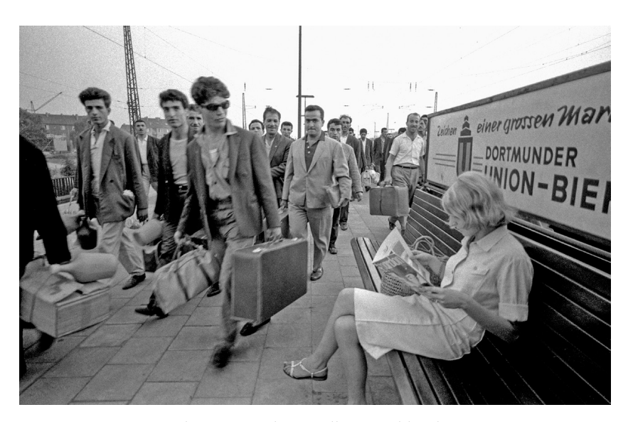
FIGURE 1.5 Male guest workers walk past a blonde German woman with a short skirt upon their arrival in Dortmund, 1964.

Beyond the transnational discourses, concerns about sex were central to guest workers' everyday lives. Alongside homesickness and isolation, male guest workers often complained about sexual malaise, with one man calling himself "psychologically ill" due to the lack of physical and emotional intimacy. <sup>69</sup> Another young guest worker was so starved for sex that he admitted having to restrain himself from touching a German woman on a streetcar, confessing that she was so "beautiful" and "free" and "smell[ed] so good."70 Married guest workers were further constrained by their vows, as well as Turkish law, which expressly forbid adultery. Not until the rise of family reunification in the 1970s, when guest workers increasingly brought their spouses to Germany, could they have sex within marriage on a regular basis. If a guest worker alone in Germany wished to have sex with their spouse, they would have to wait until they traveled back to Turkey on vacation, which usually took place just once per year. In 1975, a Turkish midwife in the small village of Calapverdi explained that the ability to have sex only during their summer vacations drastically impacted birthrates in guest workers' home