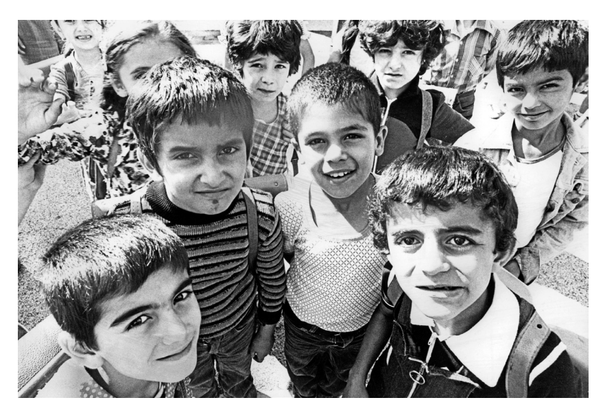
FIGURE 1.6 Turkish children outside a West German elementary school in Duisburg-Hamborn.

of all children left behind, as many found advantages, and even power, in their situations. 119