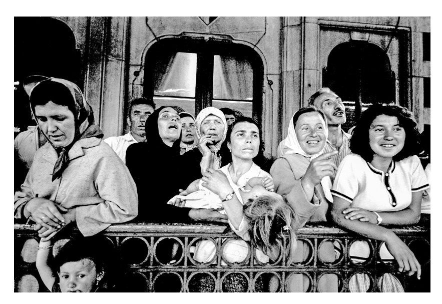
FIGURE 1.1 With mixed emotions, family members watch guest workers depart for Germany at Istanbul's Sirkeci Train Station, 1964.

For those who survived the arduous recruitment process, then came the scene of departure, full of tearful goodbyes at Istanbul's Sirkeci Train Station (Figure 1.1). Friends, parents, aunts, uncles, spouses, and children all crowded together, reaching over the wooden gates for one last hug and kiss. "We'll miss you! Send us a color photo from Germany!" they shouted.<sup>3</sup> Only those from Istanbul enjoyed the luxury of being present on the platform. Others, from all throughout the vast country, had already said their goodbyes. As the train door shut, they strained their necks to look upward at the windows, catching a final glimpse before the departure. Some embarking on the journey waved excitedly back, while others stared wistfully into the distance, wondering if they would soon regret their decision. The stay in Germany was only supposed to last two years, but neither the guest workers nor their loved ones knew when they would be reunited. They hoped that the happy day would come soon.