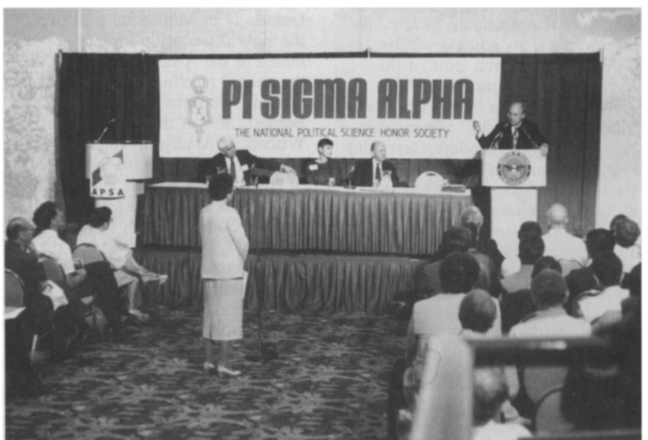
Secretary of Defense Richard Cheney delivers first Pi Sigma Alpha Lecture.