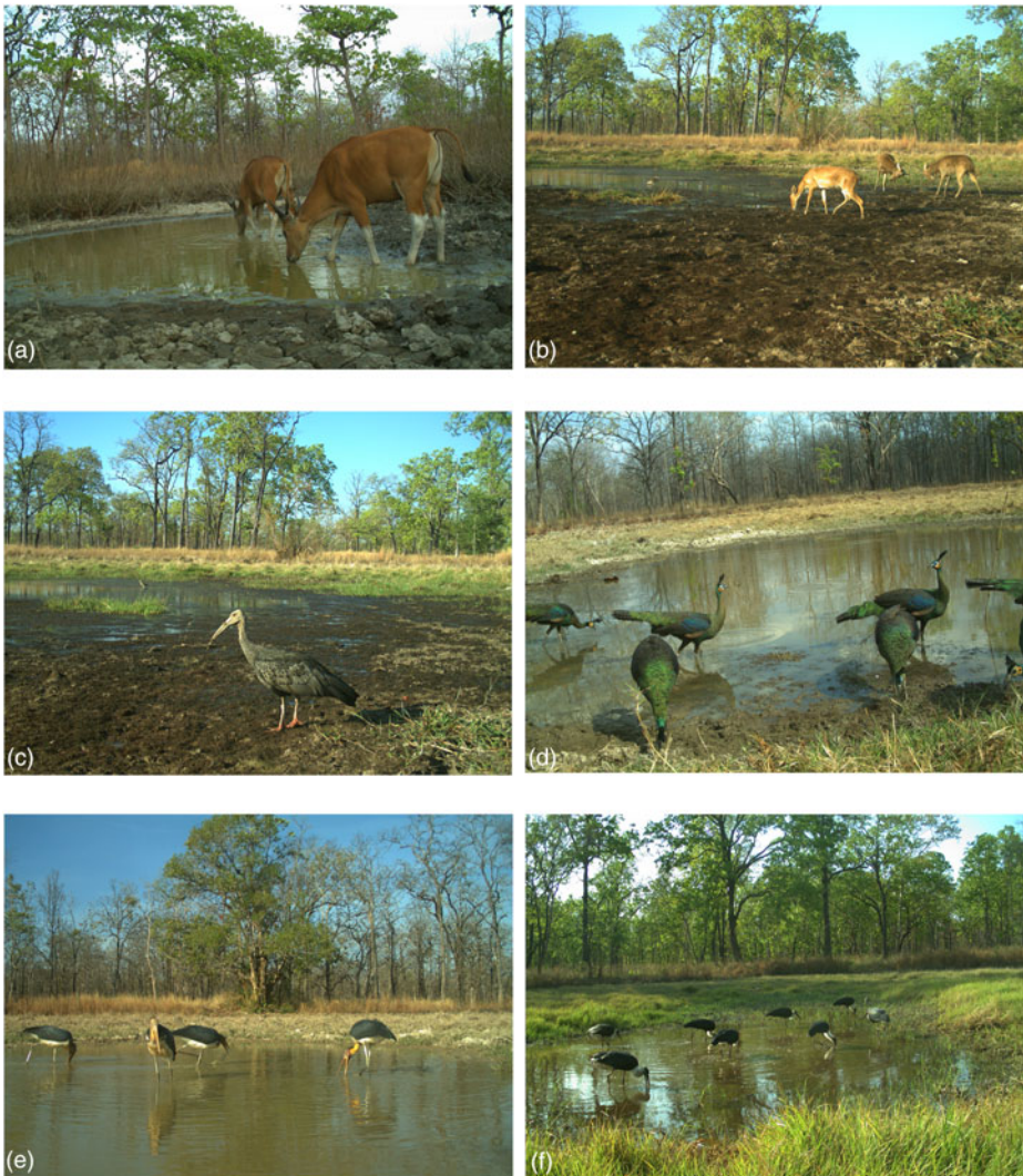
PLATE 1 Photographs of (a) banteng Bos javanicus , (b) Eld's deer Rucervus eldii , (c) giant ibis Thaumatibis gigantea , (d) green peafowl Pavo muticus , (e) lesser adjutant Leptoptilos javanicus and (f) Asian woolly-necked stork Ciconia episcopus drinking and/or foraging at waterholes during the dry season of December 2015–June 2016.

ibis was the only species that was also associated with the abundance of neighbouring waterholes. All species except green peafowl were more likely to occur at waterholes further from villages.