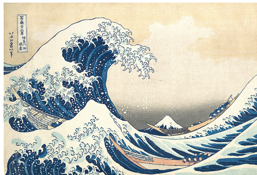
The Great Wave off Kanagawa, Katsushika Hokusai.

We develop a general theory of higher semiadditive Fourier transforms that includes both the classical discrete Fourier transform for finite abelian groups at height n = 0 , as well as a certain duality for the E_n -(co)homology of \pi -finite spectra, established by Hopkins and Lurie, at heights n \geq 1 . We use this theory to generalize said duality in three different directions. First, we extend it from \mathbb{Z} -module spectra to all (suitably finite) spectra and use it to compute the discrepancy spectrum of E_n . Second, we lift it to the telescopic setting by replacing E_n with T(n) -local higher cyclotomic extensions, from which we deduce various results on affineness, Eilenberg–Moore formulas and Galois extensions in the telescopic setting. Third, we categorify their result into an equivalence of two symmetric monoidal \infty -categories of local systems of K(n) -local E_n -modules and relate it to (semiadditive) redshift phenomena.