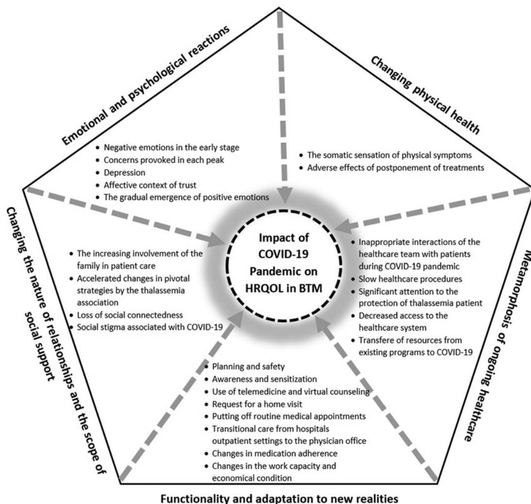
Figure 3. Themes and subthemes developed in this study

P16: “Injecting seasonal flu vaccine for free by the healthcare system alleviated my concern. It showed that thalassemia patients are not neglected.” (Male, 29 years old)