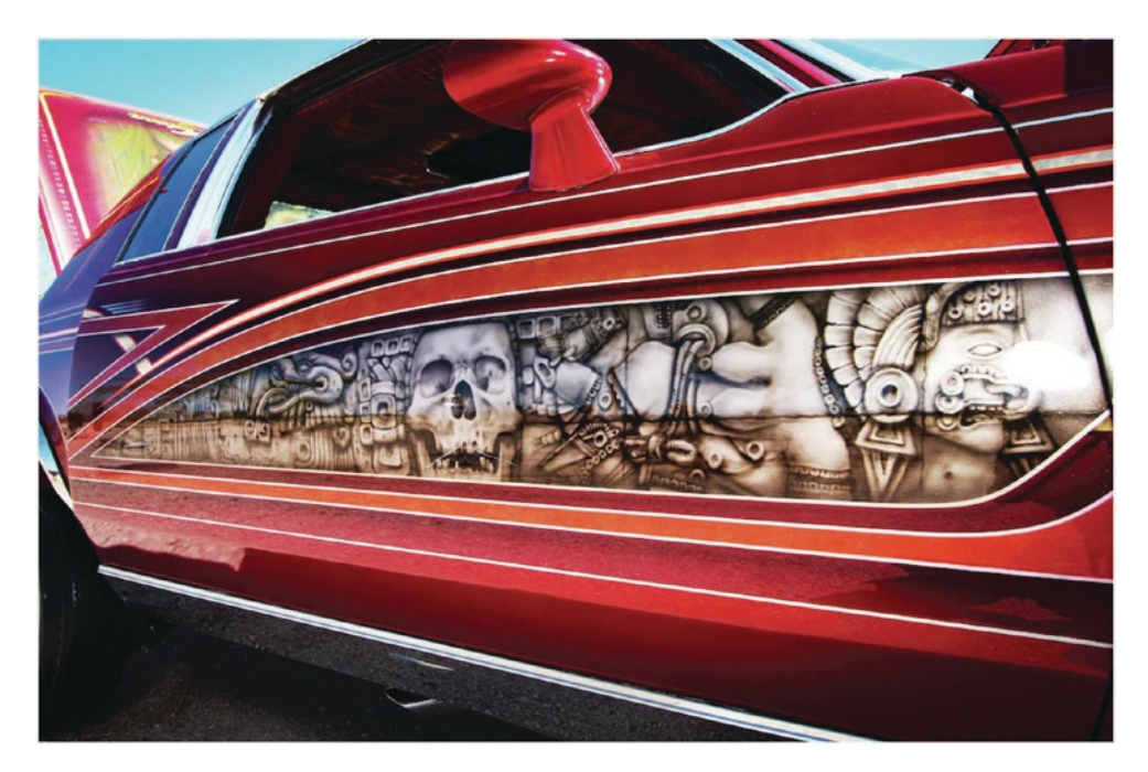
Figure 3. El Rey Azteca side panel.

1960s the winner of a "Miss Hot Tamale" contest in a chili festival would land a job extolling "the power of 'hot' engines" (Krevsky 2008:92), welding together women, desire, and automobility, a perspective that persists to this day.