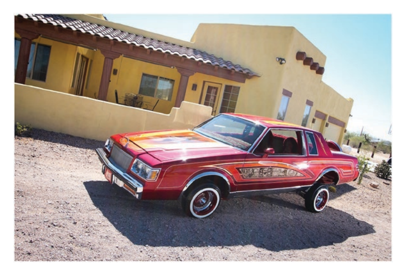
Figure 2. The 1985 Buick Regal nicknamed El Rey Azteca, featured in a 2014 MotorTrend article.

The first issue of Lowrider was fresh and unique. It was kind of crude, but despite its crudeness, you could tell that it was on its way. It was aimed at the streets, the heart and soul of the barrios. (1997:23)