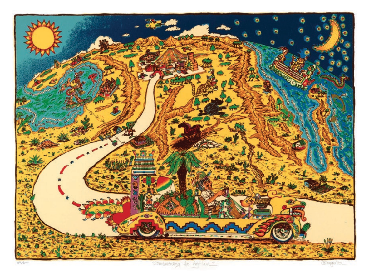
Figure 4. Returning to Aztlan, 1983. (Photo courtesy of the Estate of Gilbert "Magu" Luján)

of Chicana/o identity on a type of present-day codex that accounts for Chicana/os not as fixed objects arrested on a static map, but as drivers at the wheels of their own destiny.