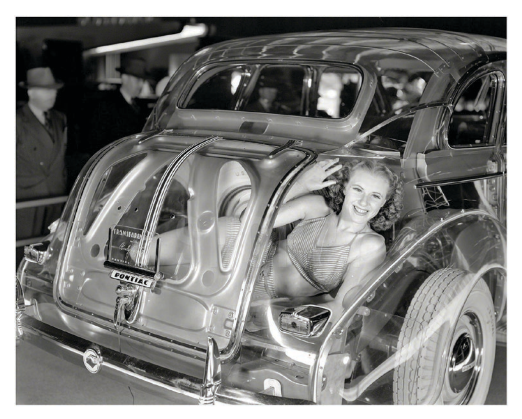
Figure 5. "Body by Fisher Pontiac Classic." Transparent car with model tucked inside the trunk, 11 June 1940. General Motors exhibit at Golden Gate International Exposition, San Francisco.

The photo is dated 11 June 1940. General Motors (GM) and Rohm and Haas (R&H) chemical company originally built this vehicle, now known as the "Ghost Car," for the 1939/40 New York World's Fair, one of only two ever made (Tate 2017). Perhaps this exhibit was a publicity stunt or an unorthodox attempt to highlight the strength and merit of R&H's newly invented shatterproof synthetic crystal-clear plastic. Whatever the motivation, the fact remains that it is not just the car's body that is marketed, but a woman's inscribed body as well.