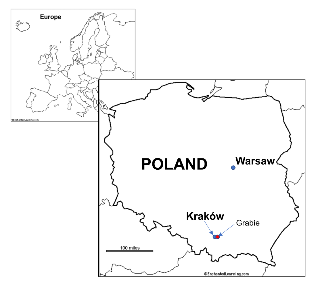
Figure 1 Location of Grabie village (50.0391 N, 19.992 E).

convent St. John the Baptist in Val Münstair in Switzerland. Also, in the works of Oppenheimer et al. (2017), Hakozaki et al. (2018), Krapiec et al. (2020), Philipsen et al. (2022), and Kuitems et al. (2022), these events were used to precisely determine the age based on changes in the concentration of radiocarbon in the sequence of annual tree rings.