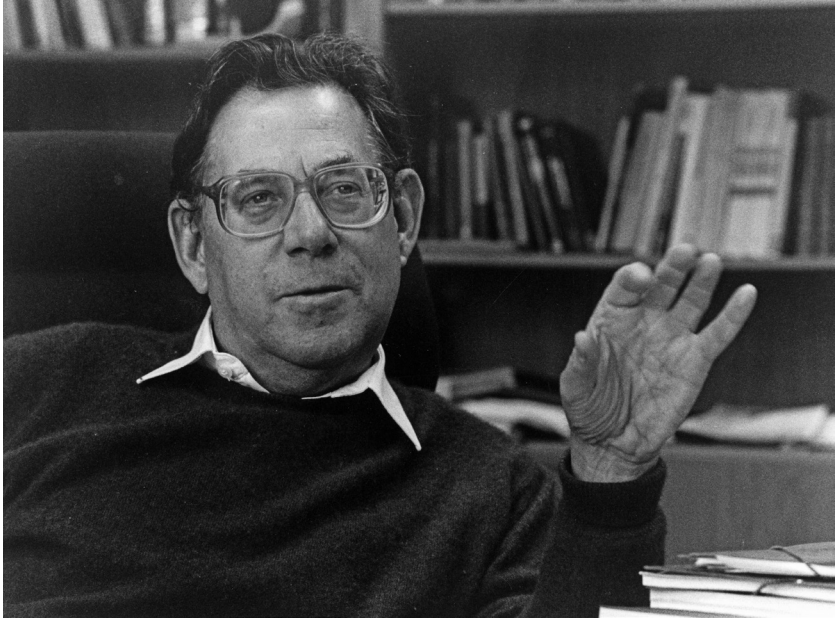
FIGURE 3.1 Netherlands-born Paul Crutzen, Nobel Laureate in Chemistry in 1995 for his work on the ozone hole, was essential in the formation of Stockholm into a global hub of environmental and climate science. He was employed by Stockholm University as a computer programmer in 1959 and wrote foundational papers from the year 2000 proposing the Anthropocene as a new geological epoch.

1961–1962, working together with Bolin. The late 1950s also included the incidental hiring of a certain Dutch civil engineer specializing in bridge construction, Paul Crutzen (Figure 3.1), who had been living in the central Swedish city of Gävle with his Finnish wife. Answering a newspaper ad for a computer programmer, Crutzen would become employed by the Meteorological Institute, where he also took courses and subsequently began his PhD training with Bert Bolin as his supervisor. During his time at Stockholm University, Crutzen would also contribute important early articles on stratospheric ozone depletion to Ambio , a journal based at the Royal Swedish Academy of Sciences for which he also served on the editorial board. 18 After graduating in 1973, Crutzen fairly rapidly became recognized as a world-leading atmospheric scientist. He was