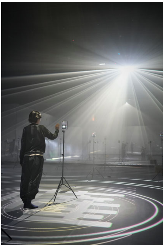
Fig. 1 Temperature monitors reflected and multiplied on the mirrored walls of the Studio Theatre in Bach Is Heart Sutra . May 2021. Cultural Centre, Hong Kong.

reminder of the pandemic and the proliferation of biometric technologies brought the city inside the theatre. Images of densely packed skyscrapers and the sea waves surrounding them were projected on the floor, bringing the city further into the space and evoking the physical topography of Hong Kong as an archipelago of over 200 islands. There was a feeling of being embodied by the city, rather than occupying it as an external environment.