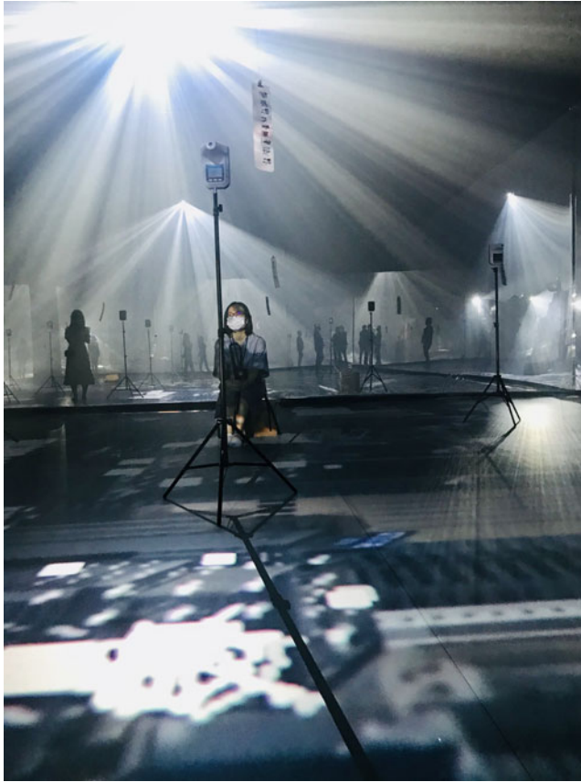
FIG. 2 Chinese characters written on fabric reading 'Emptiness is form, form is emptiness', with their digital counterparts projected across the theatre space in Bach Is Heart Sutra . May 2021. Cultural Centre, Hong Kong.

deny the existence of the words, concepts and ideas that organize our relationships with each other and with the world. Rather it means that 'we don't get caught up in their appearance'. 32 Signlessness empties signs of their appearance of solidity and separateness and sees instead interbeing. When seen with eyes of signlessness, for example, a piece of paper becomes the trees, sunlight, soil, rain and labour that go into its existence. Likewise, all objects are transformed from solid forms, singular identities and stable concepts into expressions of interdependent co-arising. 33