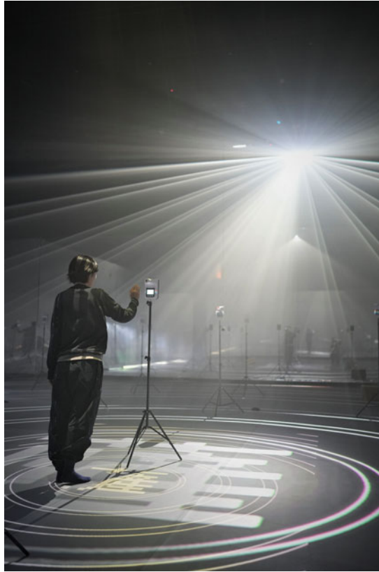
FIG. 1 Temperature monitors reflected and multiplied on the mirrored walls of the Studio Theatre in Bach Is Heart Sutra . May 2021. Cultural Centre, Hong Kong.

reminder of the pandemic and the proliferation of biometric technologies brought the city inside the theatre. Images of densely packed skyscrapers and the sea waves surrounding them were projected on the floor, bringing the city further into the space and evoking the physical topography of Hong Kong as an archipelago of over 200 islands. There was a feeling of being embodied by the city, rather than occupying it as an external environment.