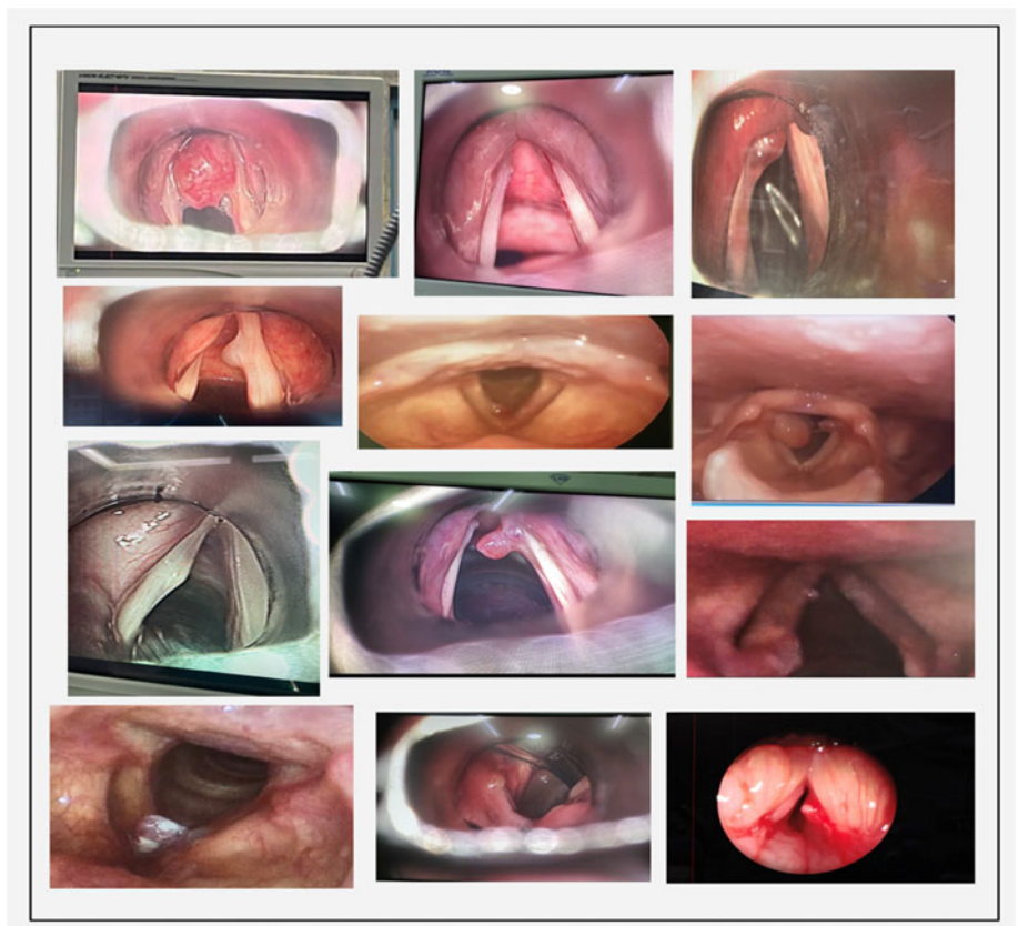
Figure 1. Intra-operative findings seen during microlaryngoscopy.

While there was a significant difference in one-week values after surgery between the absolute and relative voice-rest groups ( p = 0.035 ), no such significant difference was shown in the one-month values following surgery between the groups ( p = 0.512 ). There was a significant difference in one-month post-surgical values between the groups ( p = 0.020 ), but no such significant difference was shown in one-week post-surgical values between the groups ( p = 0.289 ).