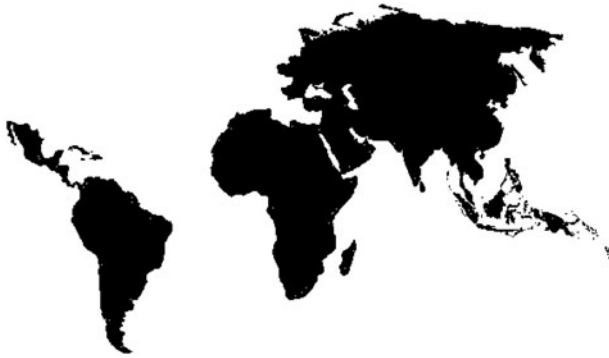
FIG. 1 Map of the developing world.