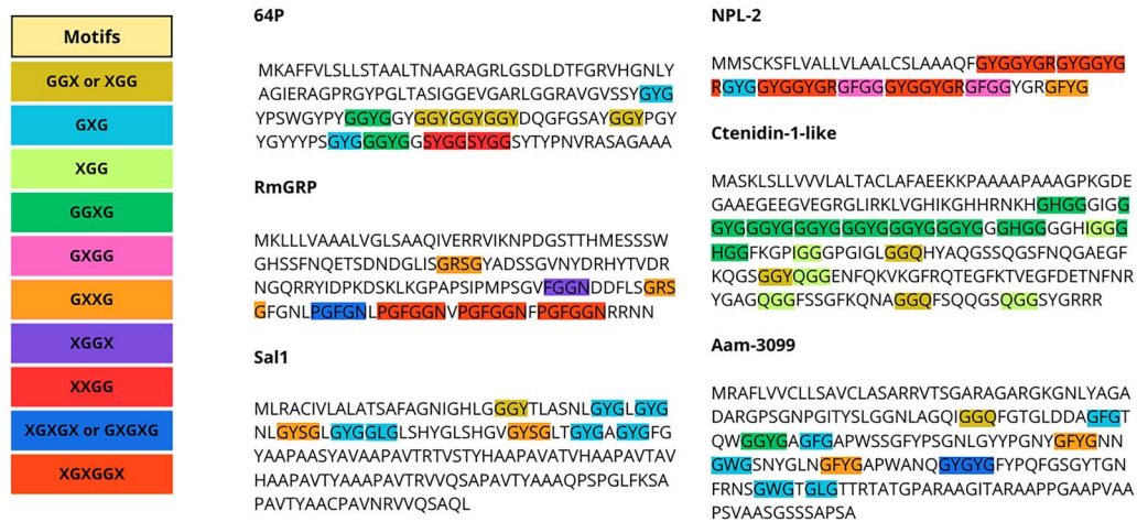
Figure 1. Gly-repeat patterns in tick GRP sequences. Each repeat is represented with a different color, and pattern variations within sequences are highlighted with the respective color. Sequences presented are: 64P of Haemaphysalis longicornis (AAM09648.1), RmGRP of Rhipicephalus microplus (AQX36208.1), Sal 1 of Rhipicephalus annulatus (AGR45924.1), NPL-2 of Ixodes scapularis (EEC15723.1), Ctenidin-1-like of Ixodes scapularis (XP_029830867.1), and Aam-3099 of Amblyomma americanum (JAG92486.1).