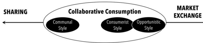
Figure 2. Positioning collaborative consumption styles (based on Guyader 2018).

who enact a communal style. A study by Klein et al (2022) showed that some people (“prosumers”) purposely acquire property (e.g. they buy a car); they use it but also capitalize on their ownership by providing others with access to that asset for a fee (e.g. they rent it out). These prosumers even choose which property to acquire, based not only on their own preferences but also on what their peers would like (e.g. particular car brands).