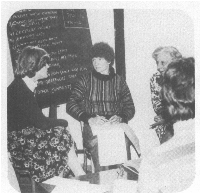
Care force meeting

Local newspapers have been used extensively to inform the community of the availability of the Care-Force services. In addition information pamphlets have been delivered to other helping organizations in each region.