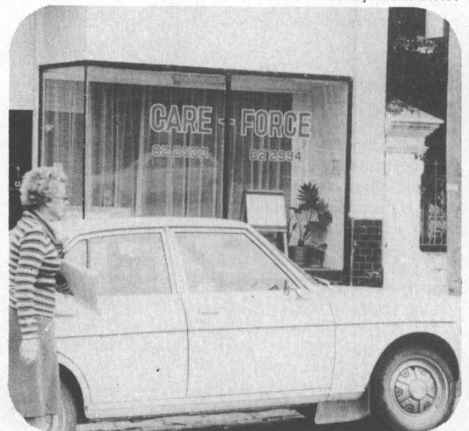
Hawthorn shop front office

(2) Care-Force, Hawthorn is developing a Drop-In programme for isolated mothers, and has been running a series of seminars on maltreatment, as part of a community education programme.