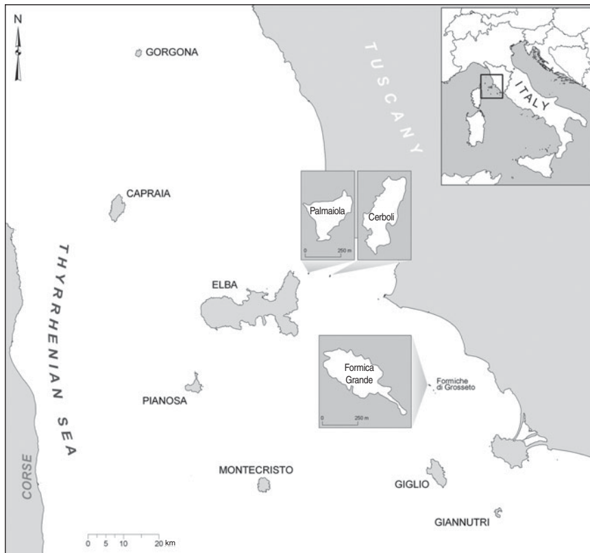
FIG. 1 The islands of the Tuscan Archipelago. The rectangle on the inset shows the location of the main map off the coast of Italy.

all the rare and vulnerable plants of the Tuscan Archipelago. Our aim here is to assess all the endemic vascular plants of the Archipelago, based on IUCN criteria (2001, 2011), and highlight threats to the flora in this territory.