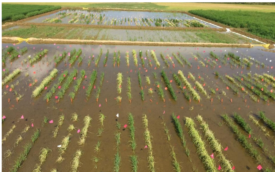
Figure 7. Individual rows of weedy rice accessions or cultivated rice cultivars 8 d following a post-flood application of benzobicyclon at 371 g ai ha -1 . Healthy rows are cultivated rice or resistant weedy rice accessions, whereas chlorotic rows are benzobicyclon-sensitive weedy rice accessions.

and complete loss of the crop can occur at higher densities in some instances (Smith 1988; JKN, personal observation). In addition to crop yield loss from interference, O. sativa f. spontanea at high densities often results in lodging of the cultivated crop, which further complicates harvesting.