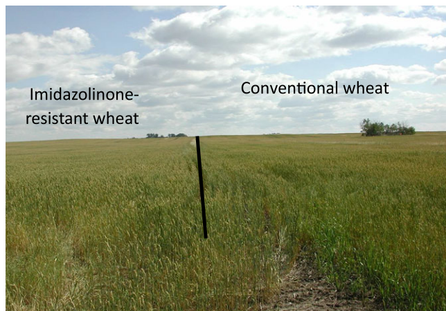
Figure 9. Field-scale evaluation of imidazolinone-resistant (Clearfield®) wheat compared with non-herbicide resistant wheat (including volunteers the following year) in Saskatchewan, Canada, in the early 2000s (adapted from Beckie et al. 2011).