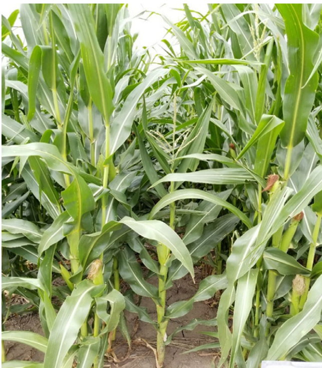
Figure 3. Volunteer corn in a cornfield in Nebraska. Highly productive soils and easy access to irrigation have encouraged growers to adopt a corn-on-corn cropping system in south-central Nebraska that results in corn volunteers.

a corn replant situation, control of GR corn was greater than 90% with paraquat ( 70 \text{ g ai ha}^{-1} ) in a mixture with a photosystem II inhibitor such as atrazine, diuron, metribuzin, or linuron before replant (Steckel et al. 2009).