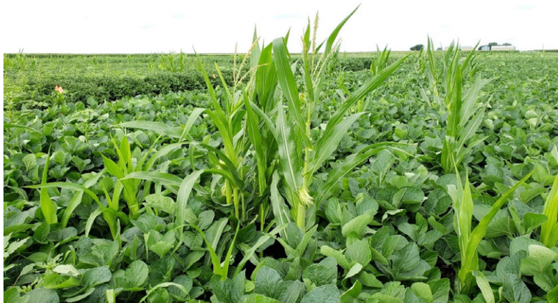
Figure 2. Soybean after corn is a typical rotation in the midwestern United States. If not controlled, volunteer corn is a problem weed in soybean fields.