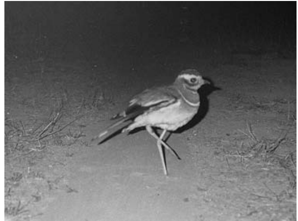
Plate 1 Automatic flash photograph of a Jerdon's courser triggered when the bird broke an infra-red beam at 00.24 on 14 February 2001. The bird is leaving footprints across a tracking strip (a 25 cm wide, 5 m long strip of fine soil placed between the transmitting and receiving units of the triggering device).

Excluding a few nights on which the triggering devices malfunctioned, the cameras operated for 42 camera-nights (22 in JC1 and 20 in JC2). Four photographs of birds were obtained, two of Jerdon's courser (at two sites in JC1; Plate 1), one of stone-curlew Burhinus oedicephalus and one of red-wattled lapwing Vanellus