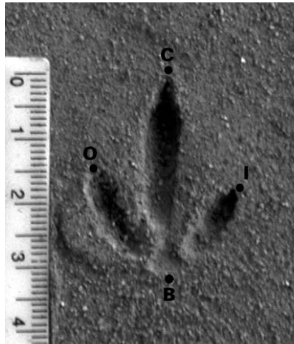
Plate 2 Footprint of a Jerdon's courser on a tracking strip from the tracking event shown in Plate 1. The scale is graduated in mm. The labels O, C, I and B mark the tips of the outer, central and inner toes and the hind margin of the foot respectively.

Table 1 shows means of measurements from photographs and plaster casts of footprints from tracking strips laid in areas selected so that tracks attributable to particular species could be obtained. All species with footprints that could be confused with those of Jerdon's courser are included, other than the sandgrouse. We also present measurements of footprints from two tracking events of Jerdon's courser in which the origin of the track was confirmed by automatic camera photographs (Plates 1 & 2). Mean measurements of 15 other tracking