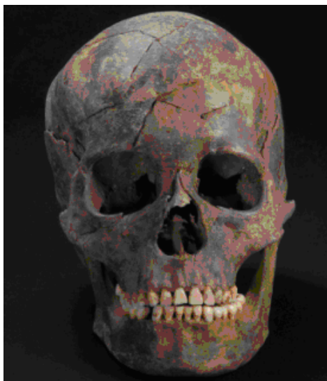
Figure 3 Skull of the Longshan Giant (frontal view)

skull, did he die in a tribal war or due to an accident occurring during brain surgery? While trepanation was common in European and Central American Neolithic societies, the practice was unusual in Asia.