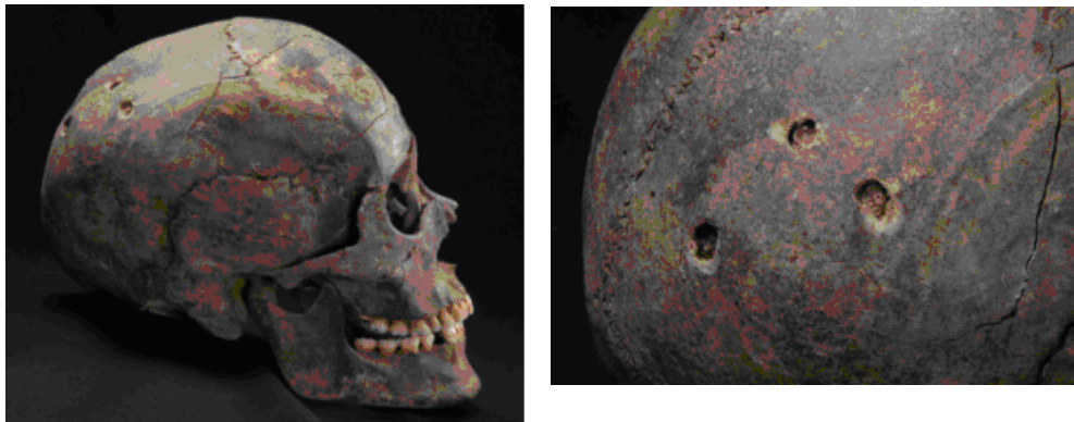
Figure 2 (A) Skull of the Longshan Giant (right-side view); (B) Close-up of the right parietal bone with drilled holes.

The skeleton was not found in an official grave; rather, it was buried in an irregular-shaped pit near the village during the Longshan cultural period (4400–4000 cal yr BP). When unearthed, the skeleton was found lying face down with both hands under the belly. No coffin, ornaments, or other burial objects were found in or around the skeletal remains. Figure 1 shows the original position of the skeleton as discovered in the field. When we removed the dirt from the skull in the field, we noted 3 holes of 5 cm in diameter drilled into the right parietal bone (Figure 2).