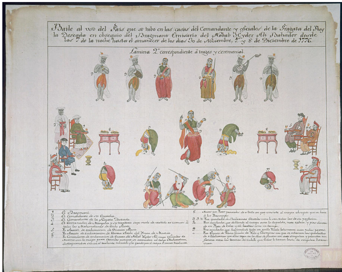
Figure 2. Local Dances in the Residence of the Spanish Commander. See Appendix I for the text