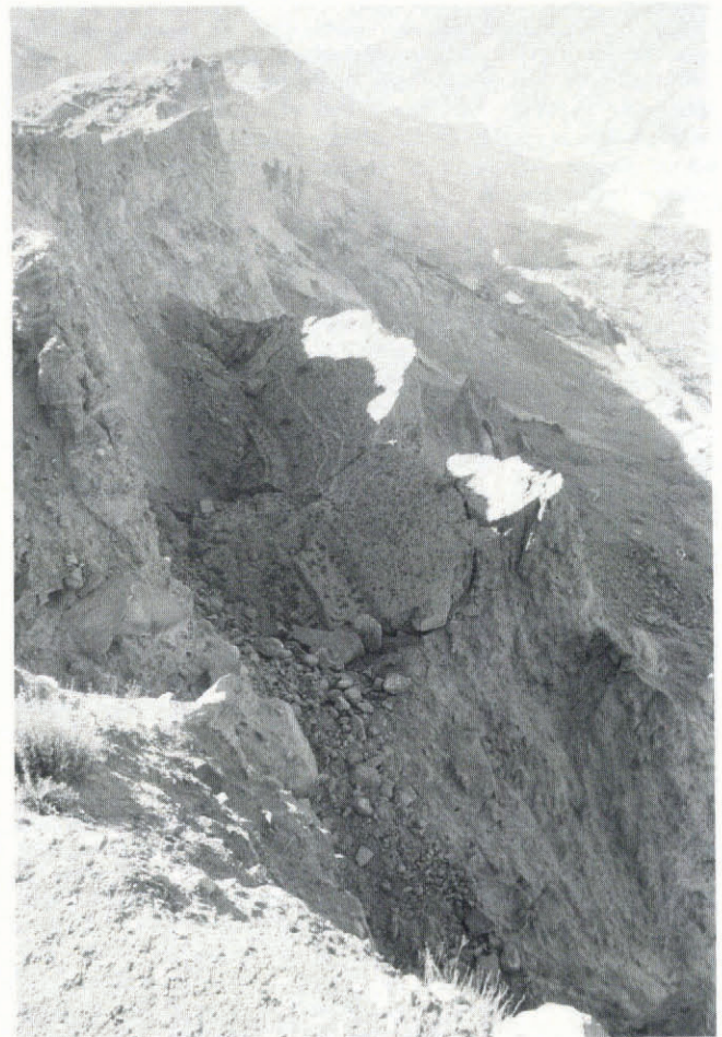
Fig. 3. Slump blocks on Hopar slope. Block in foreground, detached about 8 years ago, now sits 35 m down the face and has carried away the old jeep road. View from moraine crest down-glacier, showing Bualtar Glacier in upper right corner.

extend in both width and depth as large blocks slump and descend down the slip face (Fig. 3). Down-slope there is a vertical transition in form of the relatively intact blocks found at the top through various stages of break-up. At lower levels, entire areas of the steep face appear as series of superimposed slumps coalescing near the glacier margin. The distal toes of the deposits are continually cleared by rapid ice flow as debris is both incorporated subglacially and also transported in marginal melt-water streams. Movement of blocks down the face appears to be slow and intermittent, as no appreciable movement of developing