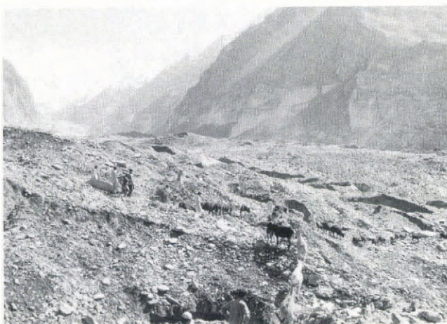
Fig. 6. Animals being herded across Bualtar Glacier to Hopar, from areas of high pasture. Daily fluctuations in ice-surface condition and slope form pose a severe hazard both to humans and to animals.

Another major impact of these landslides is the interruption and destruction of transport routes. Small footpaths which are routed on top of, and descend, the Hopar cliff face, lead across Bualtar Glacier to areas of summer pasture and wood fuel. They are continually altered due to patterns of sliding. In addition, Hopar recently lost large sections of the original jeep road. This alteration of pathways is particularly important in a society in which transhumance forms an important part of the traditional economy. Routes up-glacier and across-glacier have been affected both by slope failure and by glacier behaviour. In 1986, for example, a relatively small landslide damaged the upper part of a path down the Hopar face and significantly increased the hazard to humans and animals using the path. Similarly, it was not unusual to observe the demise of sheep and goats which had slipped into crevasses when ice-surface conditions obstructed the route across Bualtar Glacier (Fig. 6). Rapid ice acceleration during 1987 crevassed the