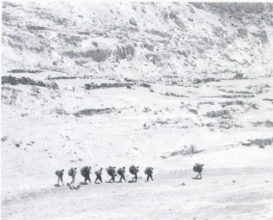
Fig. 4. Hopar villagers carrying firewood across fields of Shishkin. Note abandoned terraces, and slide scarps in upper half of photograph.

Considering the processes discussed above, the extent of physical and economic damage in Hopar is evident. As average annual precipitation is less than 130 mm at elevations below 3500 m a.s.l., irrigation water is the mainstay of life. Thus, the most severe physical impact is the occasional disruption of water supply and the infrequent complete destruction of irrigation channels. Similar landslides to those described for Hopar led to the abandonment of the settlement at Shishkin, a large summer village at the right side of Bualtar Glacier (Fig. 1) within the last quarter century. According to local informants, Shishkin once consisted of 40–50 dwellings, with terraced fields in which irrigation water supported the cultivation of wheat, barley, potatoes, alfalfa, and apricots. A combination of the rapid thinning of Barpu Glacier (Fig. 1) in the last 20 years to levels below those at which melt water can be delivered by gravity to the fields, and the recurring slumping of the moraines have hindered efforts to reconstruct irrigation channels across the slope, effectively putting an end to farming (Fig. 4). The extent of physical damage in Shishkin is shown in Figure 5.