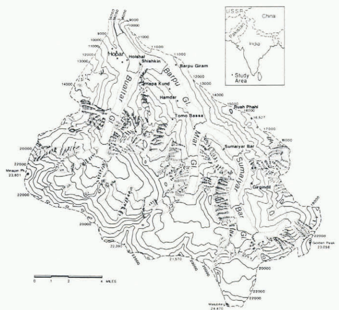
Fig. 1. Location of study area.

In the past, the subsistence economy relied primarily upon the husbandry of wheat, barley, potatoes, and apricots, and the rearing of sheep, goats, cattle, and yak. In recent years, however, the introduction of an external economy has altered patterns of employment and production. Increasingly, some of the men find it desirable to supplement their income by wage labour, which is available either locally