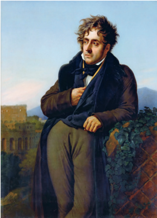
Figure 1.2 Chateaubriand Meditating upon the Ruins of Rome by Anne-Louis Girodet de Roussy-Trioson.

François-René de Chateaubriand, who came to Rome in 1803 as a secretary in the French embassy, believed that ‘a secret enthusiasm for ruins was a universal passion’ (‘tous les hommes ont un secret attrait pour les ruines’). 40 His opinion becomes especially understandable when we contemplate his portrait by Anne-Louis Girodet in the museum at Saint-Malo in Brittany, his birthplace (Figure 1.2). Chateaubriand is depicted squarely within the tradition of the grand tourist, a tradition that will be discussed in later chapters. His left arm rests upon a fine fragment of Roman stonework, in opus reticulatum , and the Colosseum forms the background. Only the