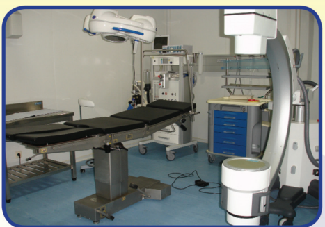
Inside OT in KATIKO Referral Hospital