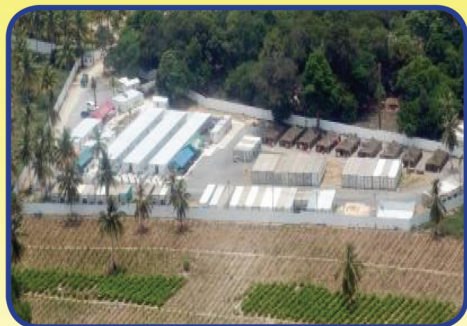
Thai Tsunami Victim Identification Centre