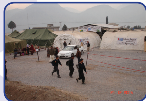
Cuban Hospital, Muzaffarabad, Pakistan