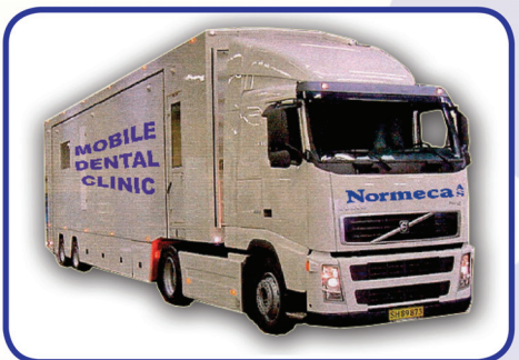
All kinds of clinics or hospitals in MultiSpace