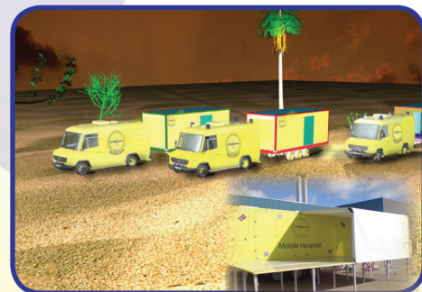
All kinds of Mobile Clinics