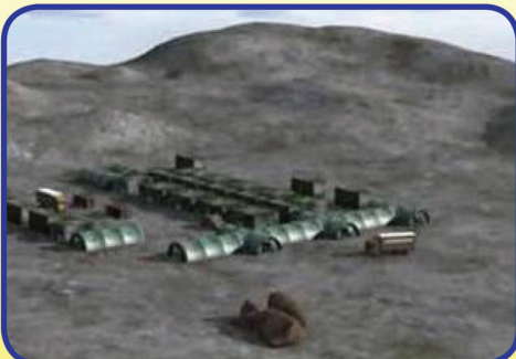
Norlense inflatable tents