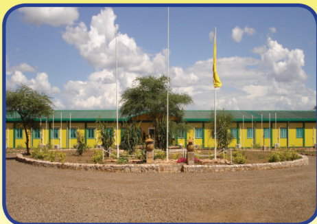
KATIKO Referral Hospital, Southern Sudan