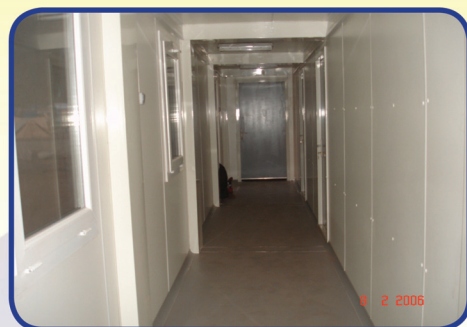
Inside MSF Hospital in Hattian Bala

Number One in the world within partly and turn key solutions incl. Transportation, Erection, Management, Training, Maintenance, Education, Administration, Storage, Out sourcing, Medivac, etc.