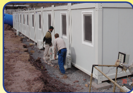
MSF Hospital, Hattian Bala, Pakistan