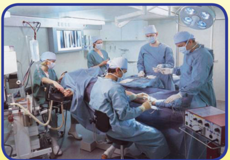
NorBase single and expandable containers