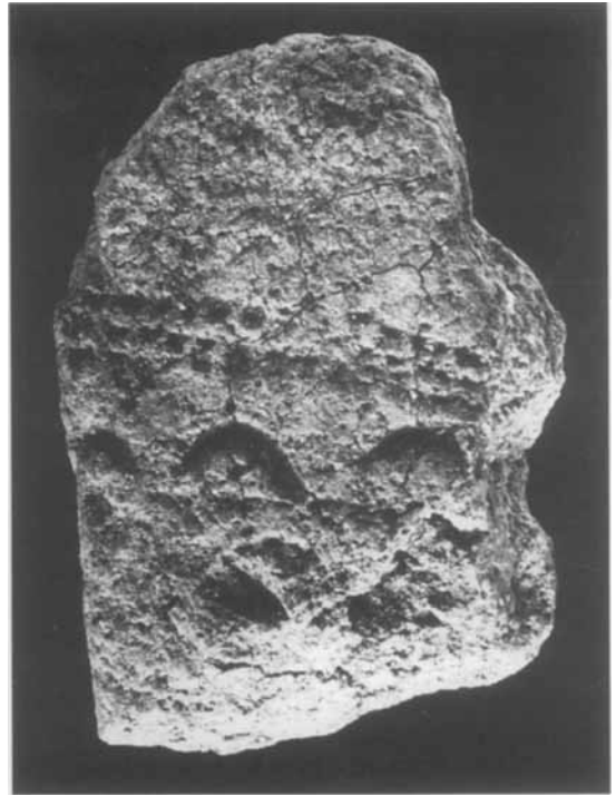
FIGURE 2. Lapita sherd, Tubungbale, Ali Island. 2.2 cm max dimension.

sherds recovered had worked their way down from higher stratigraphic levels.