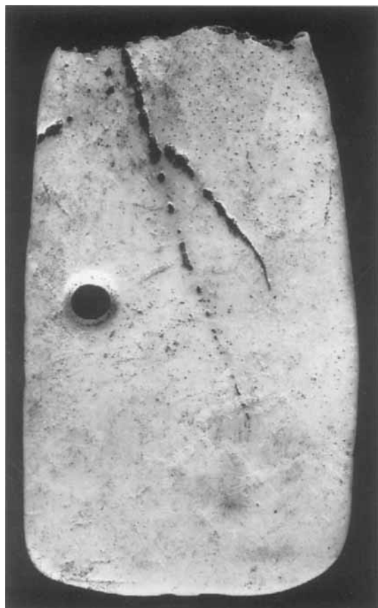
FIGURE 5. Shell pendant, Tubungbale, Ali Island. 3.4 cm max. dimension. (© The Field Museum, Chicago (IL). Photo John Weinstein, Neg. #A112902.)

pottery (Butler 1994). Our stratigraphic excavations on Tumleo Island and at Aitape in 1996 confirmed our working hypothesis: pottery-making at Aitape begins with Sumalo.