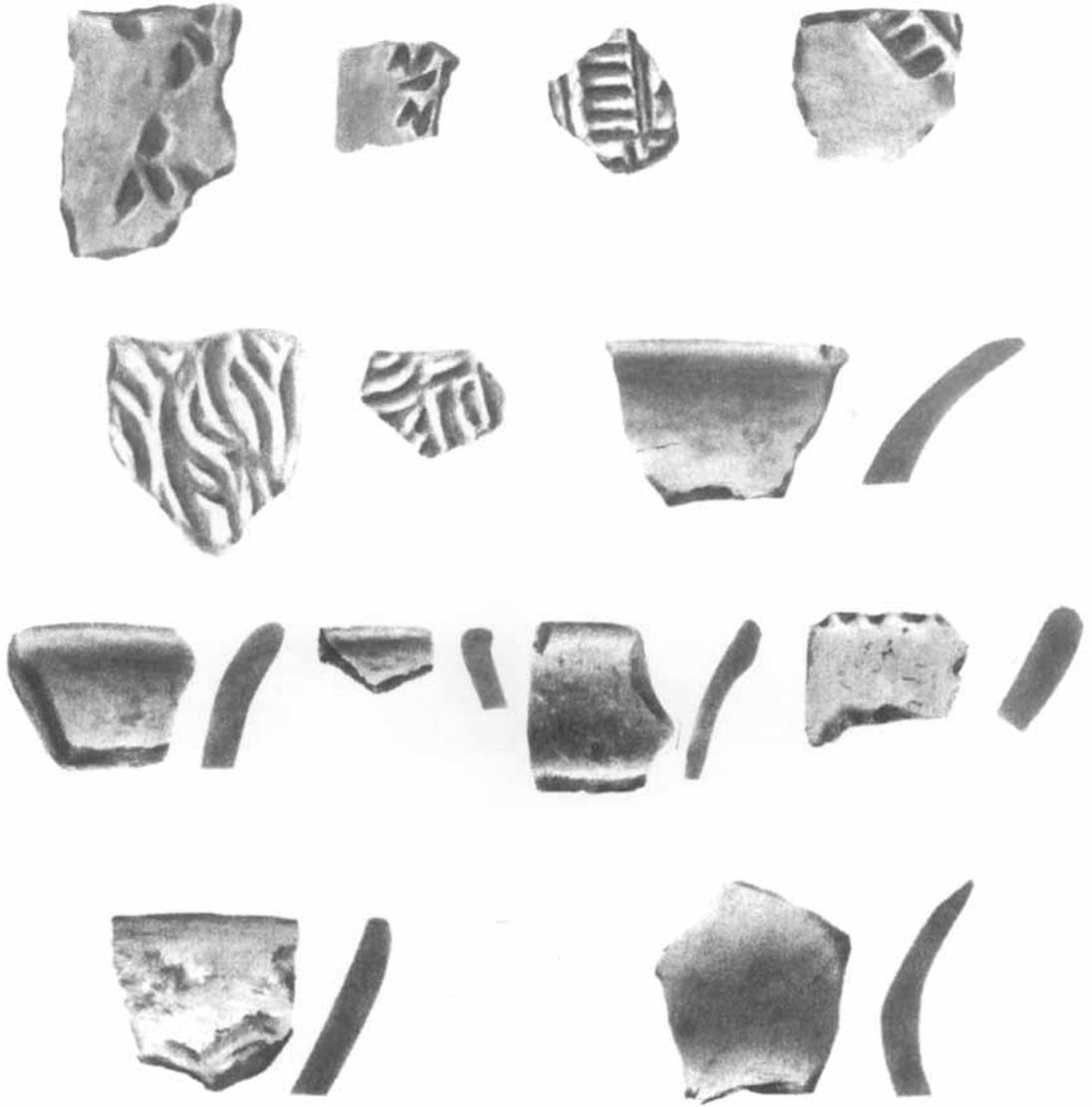
FIGURE 3. Pottery sherds from Sumalo Hill, Aitape district. (Drawing Zbigniew Jastrzebski.)

done with small-tool and pronged ('dentate') implements (FIGURE 3: 1–6). At first, we suspected that carved paddles might have been used in some instances (e.g. FIGURE 3: 5–6); closer study showed that the complex designs sometimes evidenced were achieved by multiple-scoring rather than paddle-impression. Terrell has named this simple style of mostly undecorated (but sometimes burnished) 'red-slip' ceramics Sumalo Ware after a collecting locality on Sumalo Hill near the mouth of the Raihu