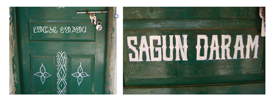
Figure 5. Adjacent hostel doors with "Sagun Daram" (Welcome) written in Ol-Chiki (left) and Roman (right) scripts

While Roman appeared together in combination with Ol-Chiki, I never saw this particular Roman script alone with Eastern Brahmi–Santali. For instance, in the Santali-language drama posters in figure 1, or in Santali-language, Eastern Brahmi–script periodicals, Romanization did not appear. Thus, this form