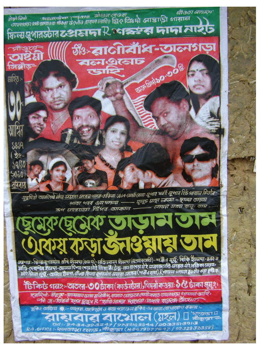
Figure 1. Santali language drama poster, Jhilimili, West Bengal.

the script coincided with the call for the establishment of the independent, indigenous-majority state of Jharkhand, which was to be carved out of the border regions of Orissa, Bihar, and West Bengal in order to provide the various forestdwelling indigenous groups a political voice in the soon-to-be-independent nation of India (Munda and Mullick 2003).