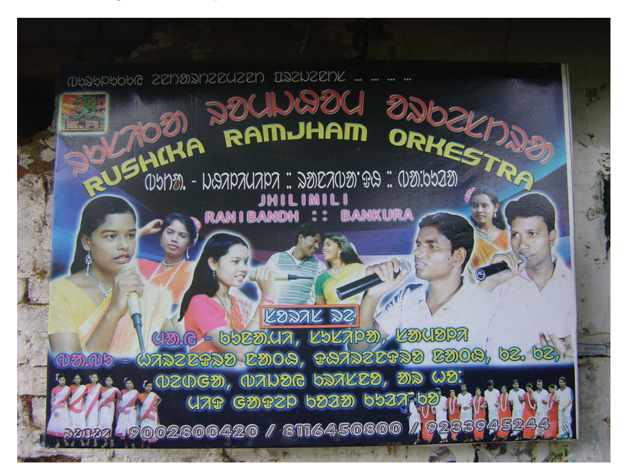
Figure 4. Poster from Jhilimili, West Bengal

on the doors of the Class 11–12 hostel doors in Ol-Chiki and the nonstandard Roman combination.