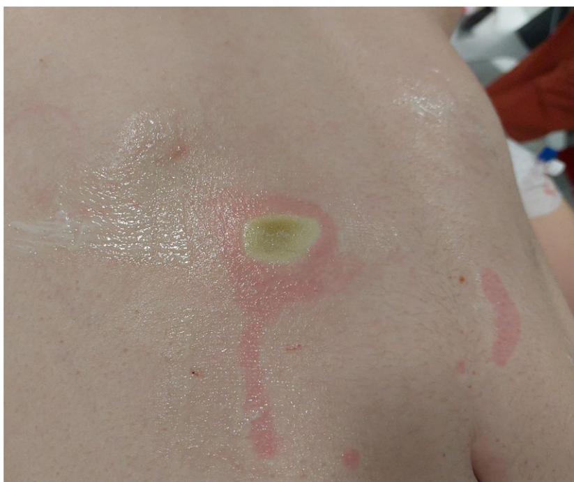
Figure 2. Third-degree skin burn at the electrode patch site.

and none of these patients had electrode patch malattachment. In the same study, the difference between the maximum current watt used and the maximum temperature reached did not statistically significantly different between the patients with skin burns and controls. 4 In another paediatric case, the lack of contact between the pad and skin and the long duration of the procedure were considered as factors that could cause skin burns. 6 In our case, the patient's body mass index was normal, and the total procedure time and the Watt and temperature used were not above the risk limits specified in the literature. 4,7 We did not observe any malattachments to lack of contact after the procedure, but the skin burn being mainly in the upper right corner of the patch electrode and presence of no other risk factors during the procedure suggest that the partial loosening of the skin-to-skin contact may have caused the skin burn.