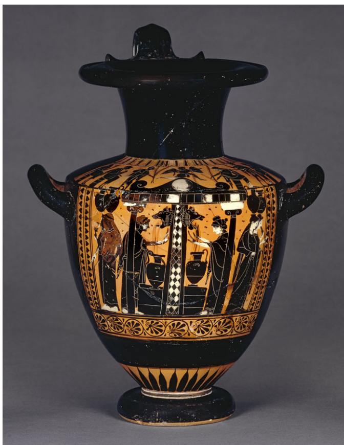
Fig. 2. Black figure hydria with women at the fountain house, ca. 520–500, Vulci. British Museum BM334.

That fetching water was gendered as women's work is also clear from the iconographic evidence, particularly scenes of women at the fountain house, popular on Athenian pottery in the late Archaic and early Classical periods. Men appear sometimes in these scenes (see below), but they are vastly outnumbered by women (see, for example, fig. 2). However, in concentrating on how these images construct idealized and idealizing notions of gender, scholars have missed the opportunity to consider how these discourses shaped lived experience. 100 Such readings deliberately set themselves apart from quotidian concerns; the depictions here are cultural constructs, not actual women whose bodies were transformed by