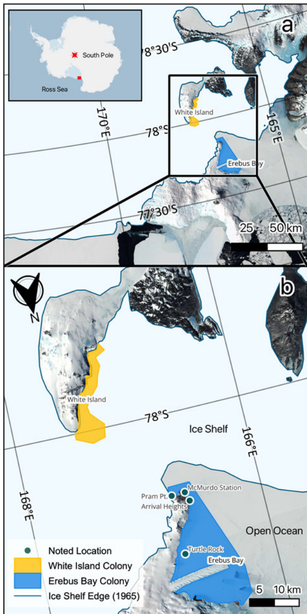
Figure 1. (a) White Island (yellow) and Erebus Bay (blue) colonies relative to the Antarctic continent. (b) A closer look at the White Island Weddell seal colony (yellow), the ice-shelf boundary (blue line), the Erebus Bay Weddell seal colony (blue) and the four discussed locations (green circles). Produced with Quantarctica ( https://www.npolar.no/quantarctica ); LIMA high-resolution imagery (15 m); SCAR Antarctic Digital Database Version 7.0.

and identifiable, allowing researchers to track any potential movement between the two colonies.